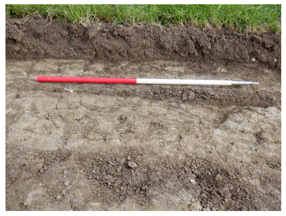
Plate 48. SE-facing section of ploughscar [25002]