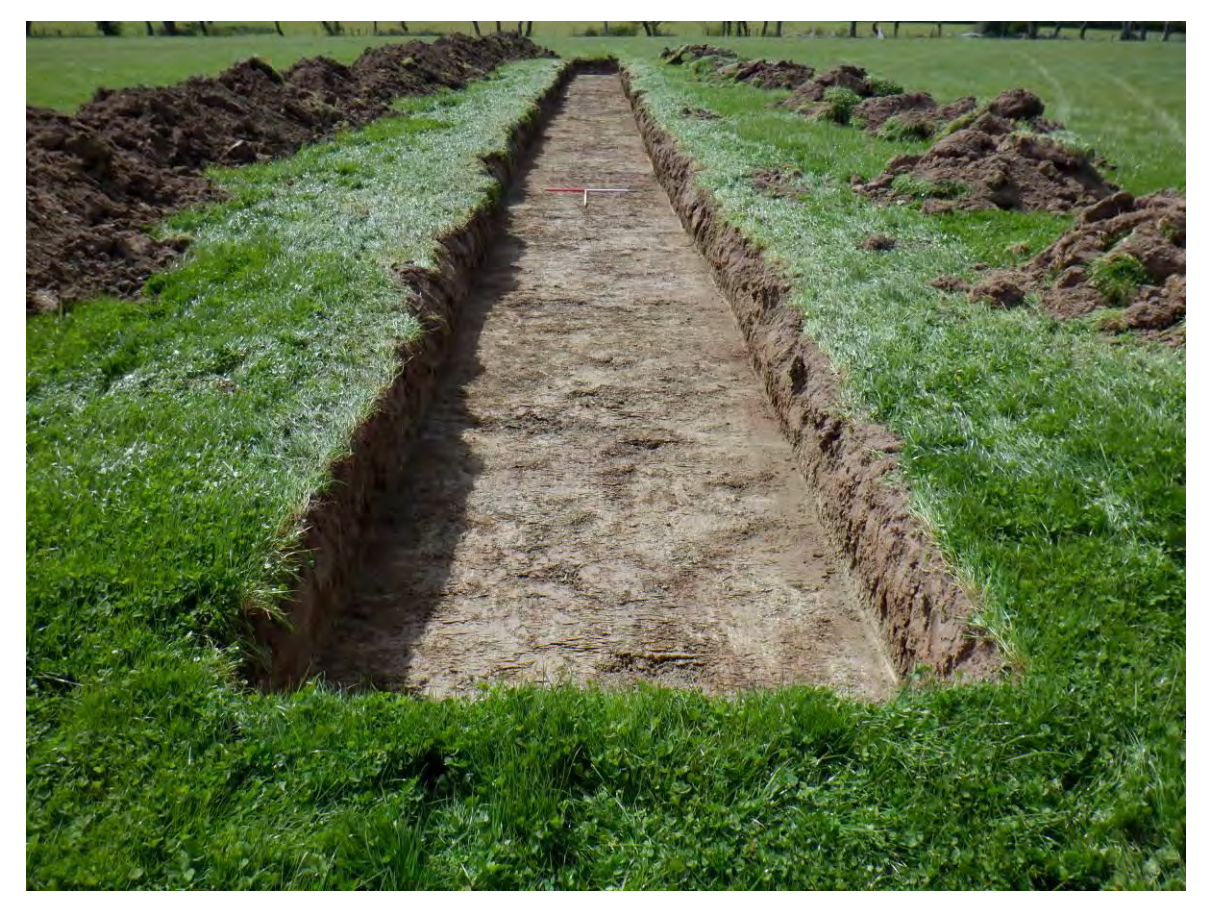
Plate 76. W-facing shot of Trench 39