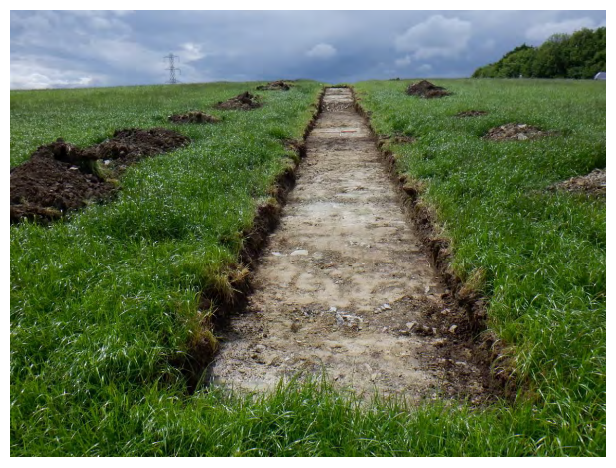
Plate 47. SW-facing shot of Trench 25