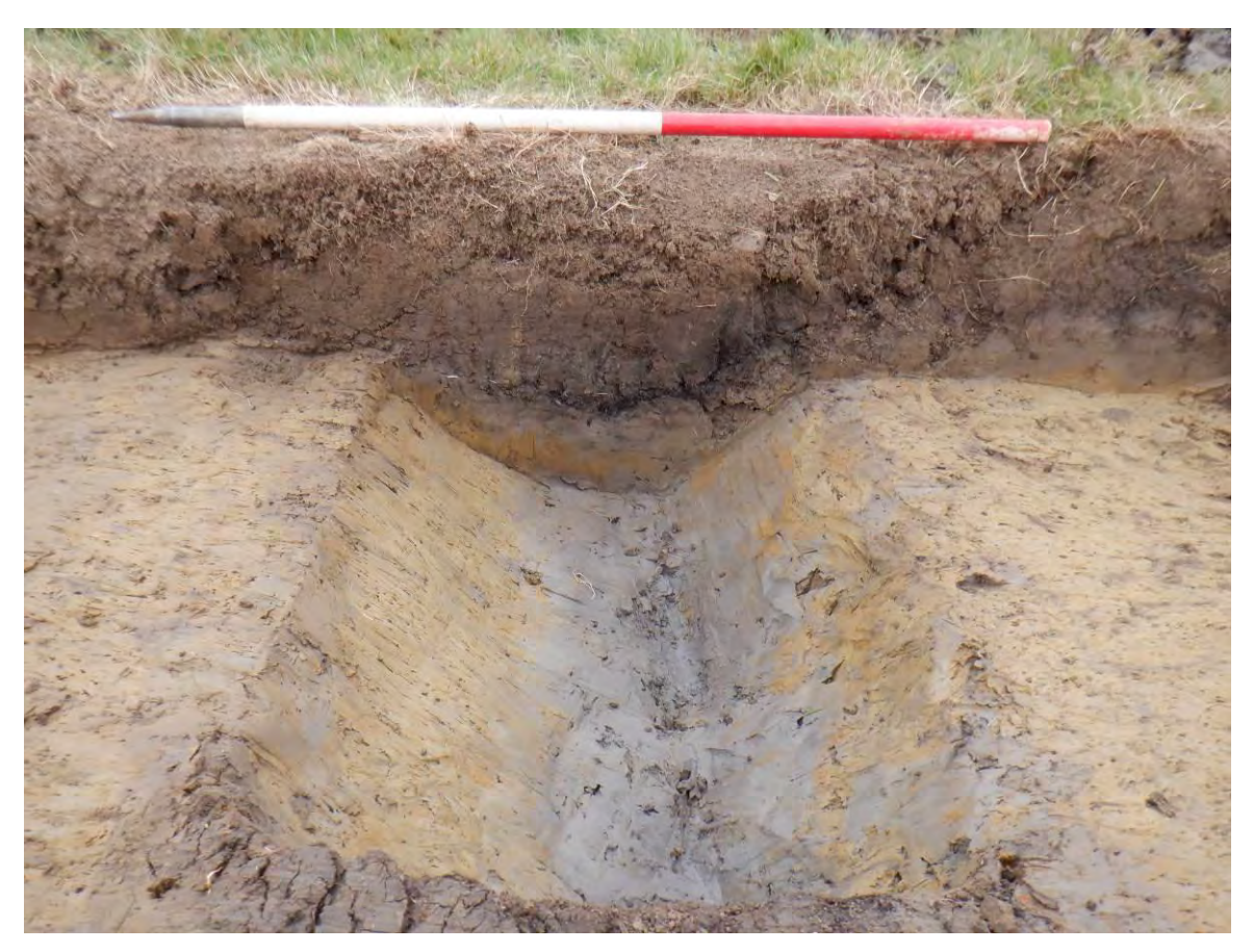
Plate 72. W-facing representative section of Trench 37 and linear [3704]