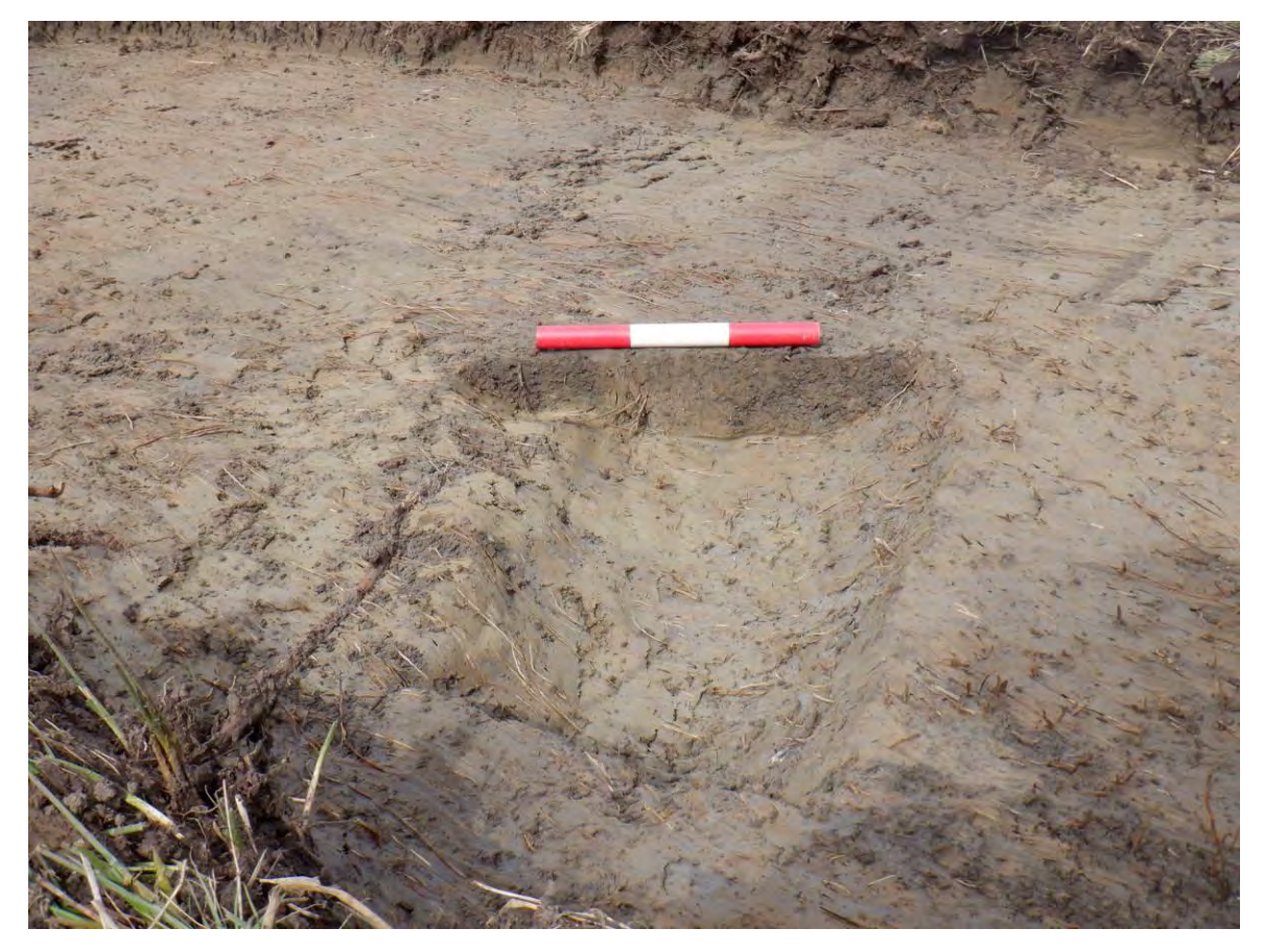
Plate 64. SW-facing section of linear [3206] and posthole [3208]