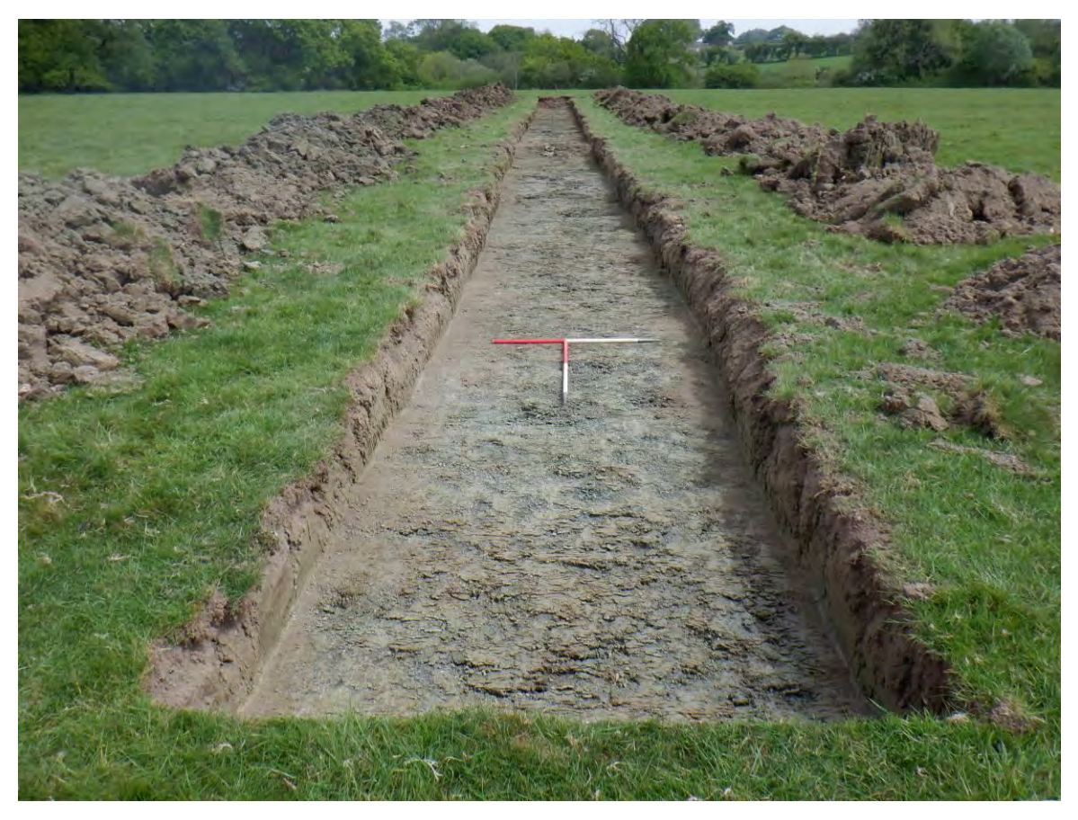
Plate 81. NE-facing shot of Trench 45