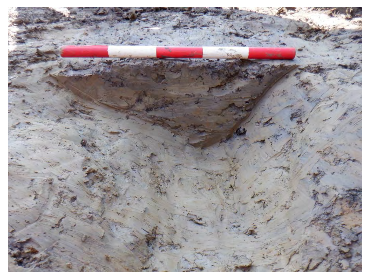
Plate 60. E-facing section of [3003]