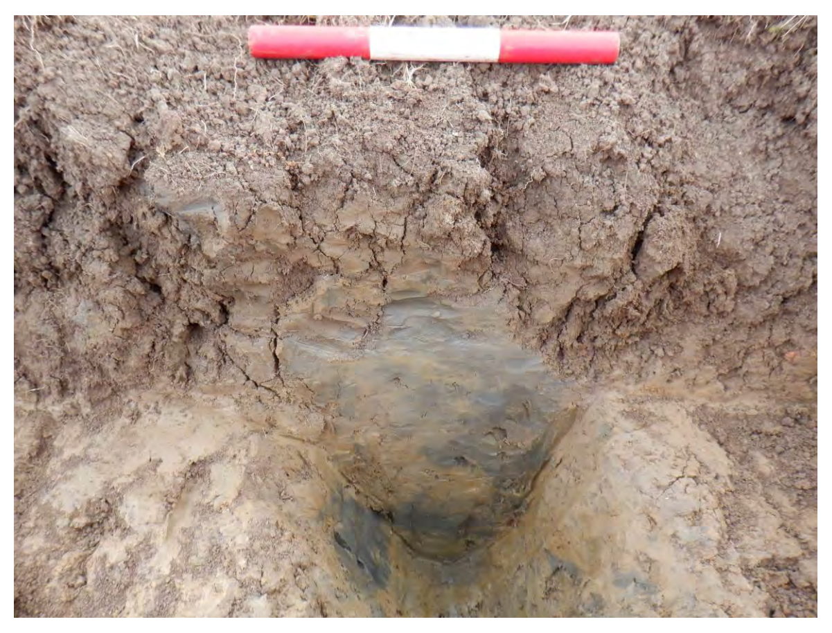
Plate 75. W-facing section of linear [3711]