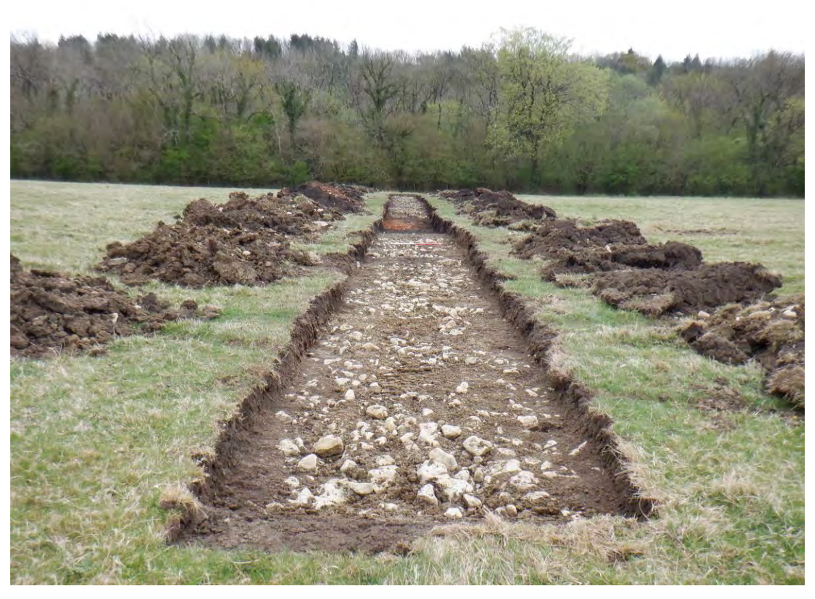
Plate 53. S-facing shot of Trench 27