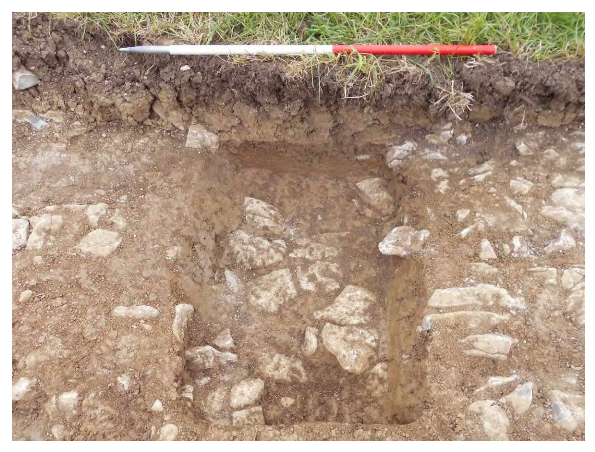
Plate 34. NE-facing section of linear [20003]