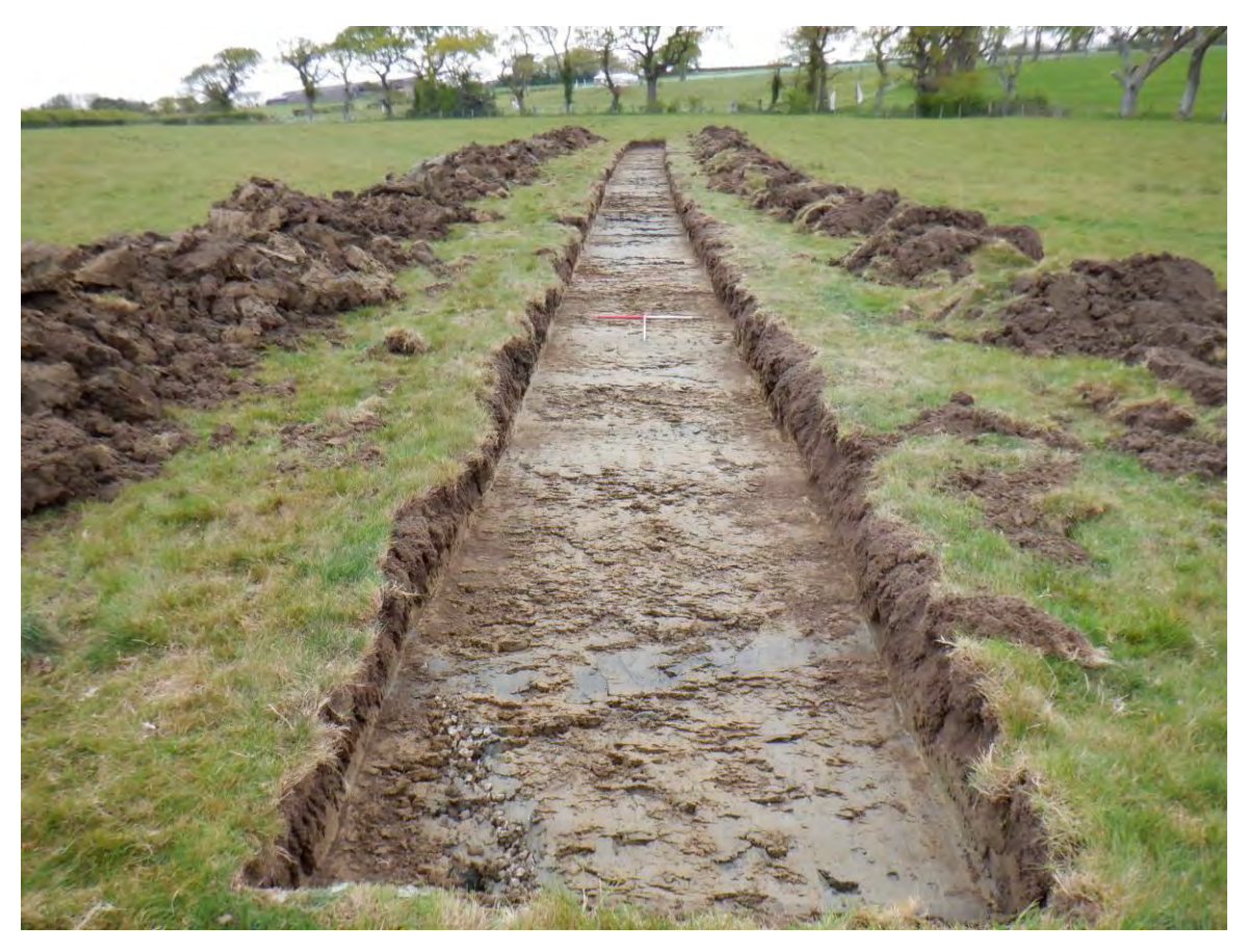
Plate 71. N-facing shot of Trench 37