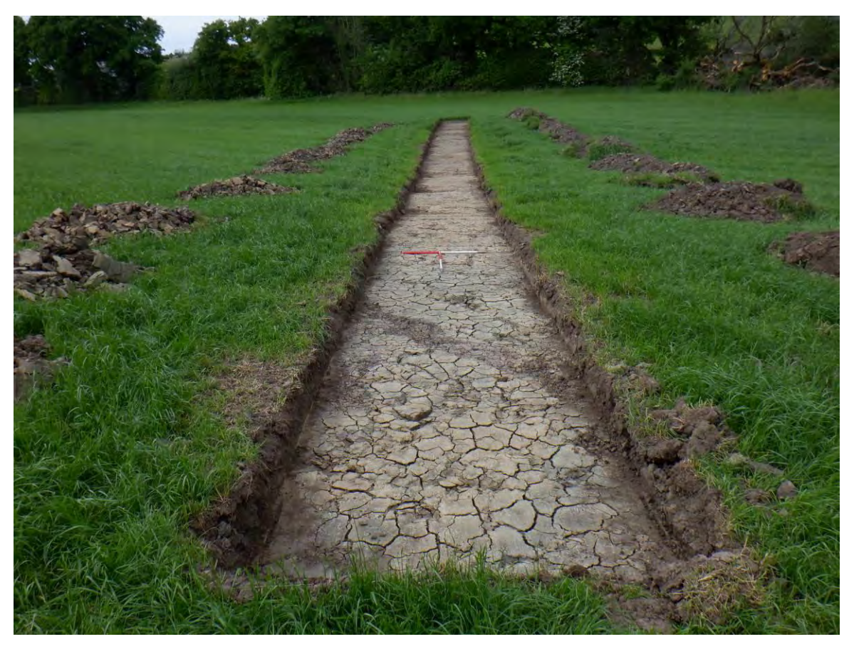
Plate 21. NW-facing shot of Trench 13