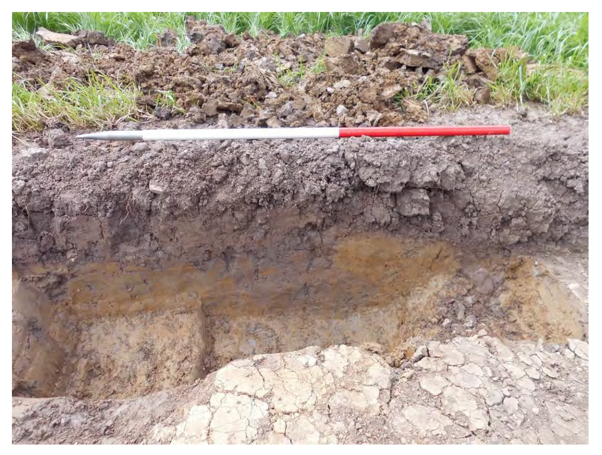
Plate 23. N-facing representative section of Trench 13 and linear [13005]