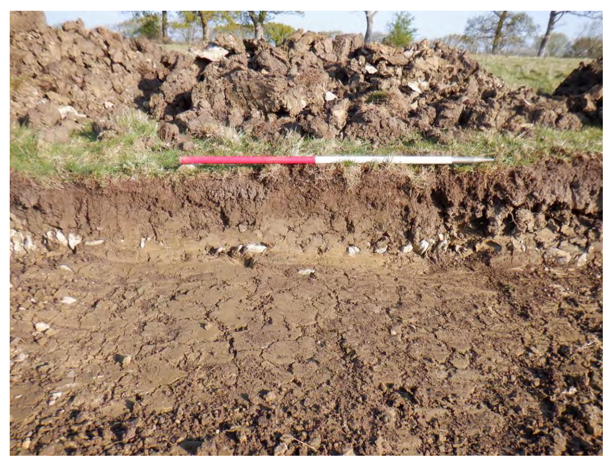
Plate 56. S-facing representative section of Trench 28 and linear [2803]