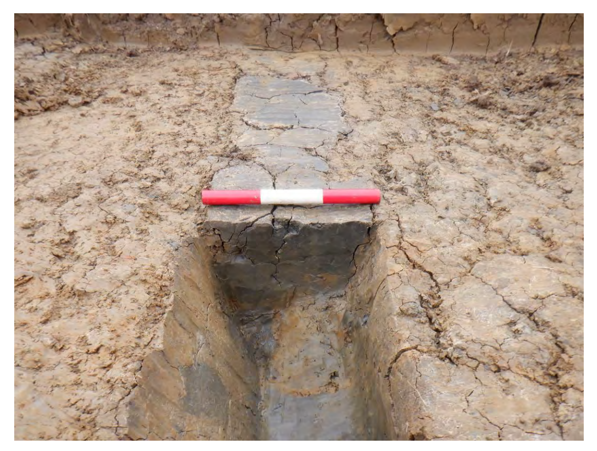
Plate 74. W-facing section of [3709]