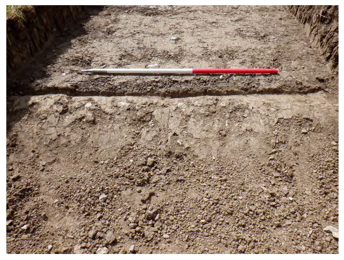
Plate 46. N-facing section of ploughscar [24008j]