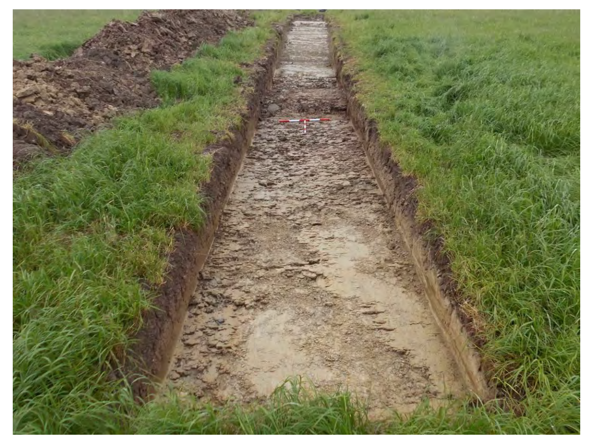
Plate 44. S-facing shot of Trench 24