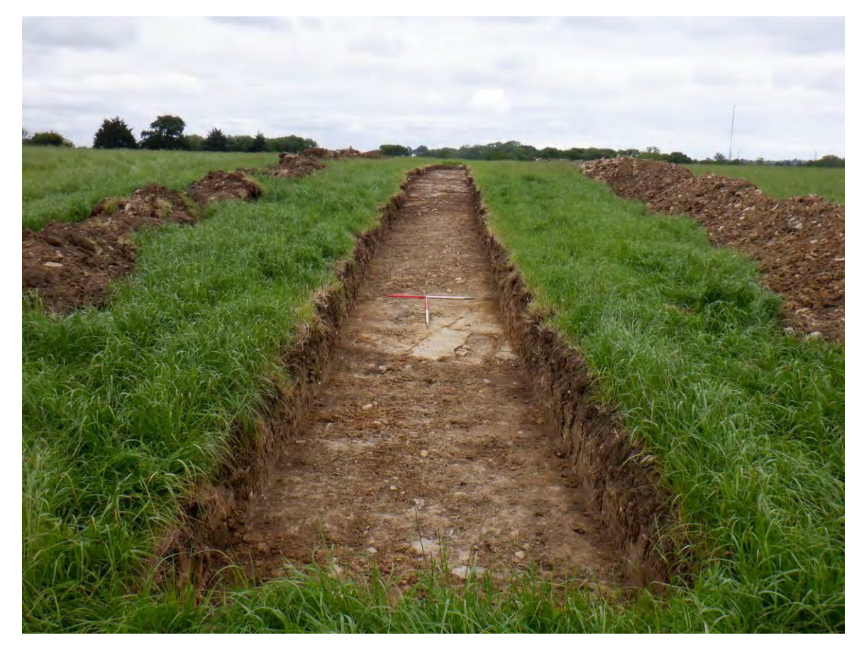
Plate 42. SW-facing shot of Trench 23