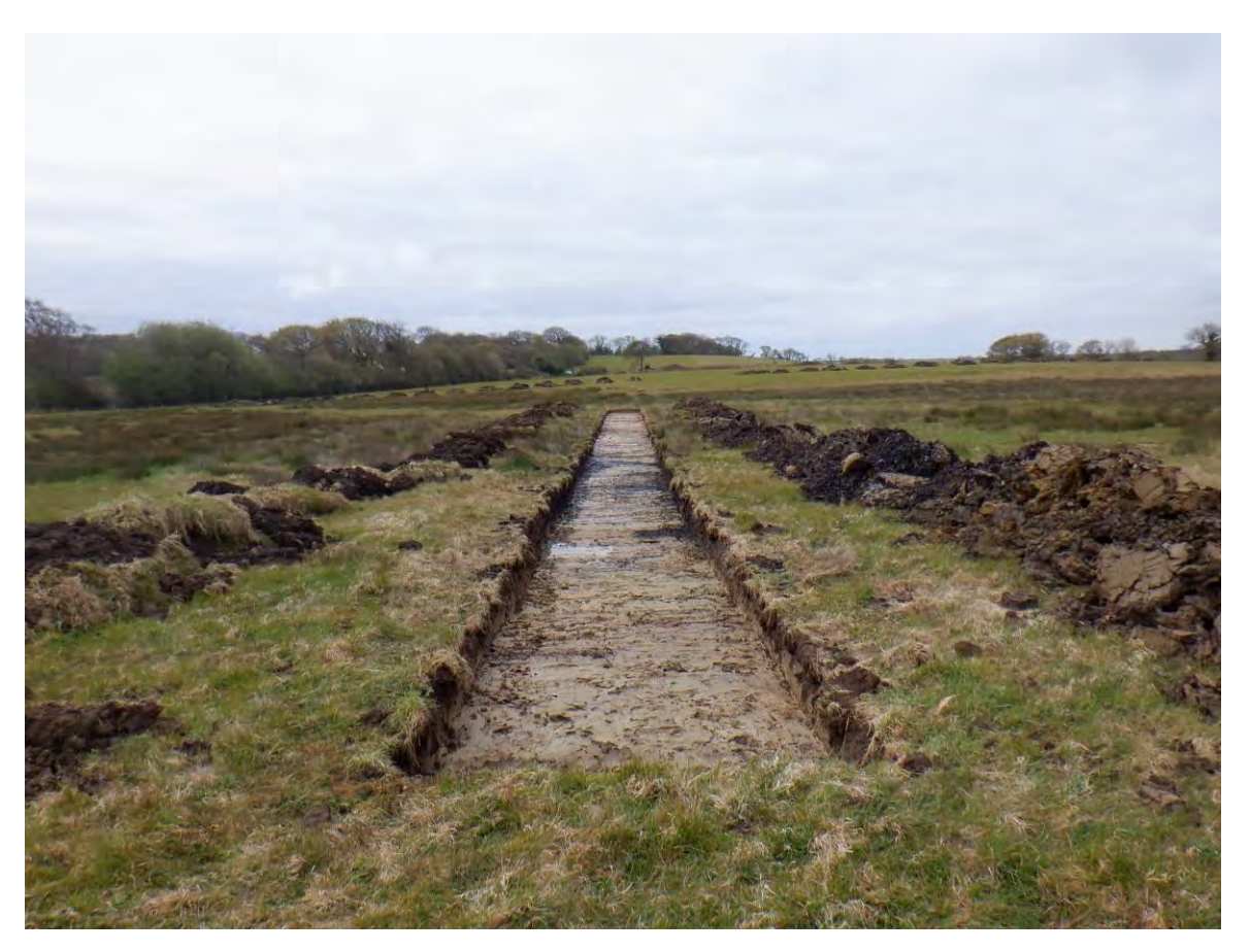
Plate 69. SW-facing shot of Trench 36