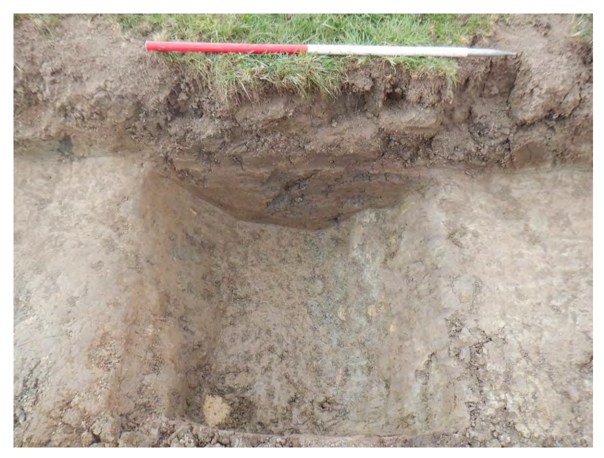
Plate 82. NW-facing representative section of Trench 45 and linear [4503]