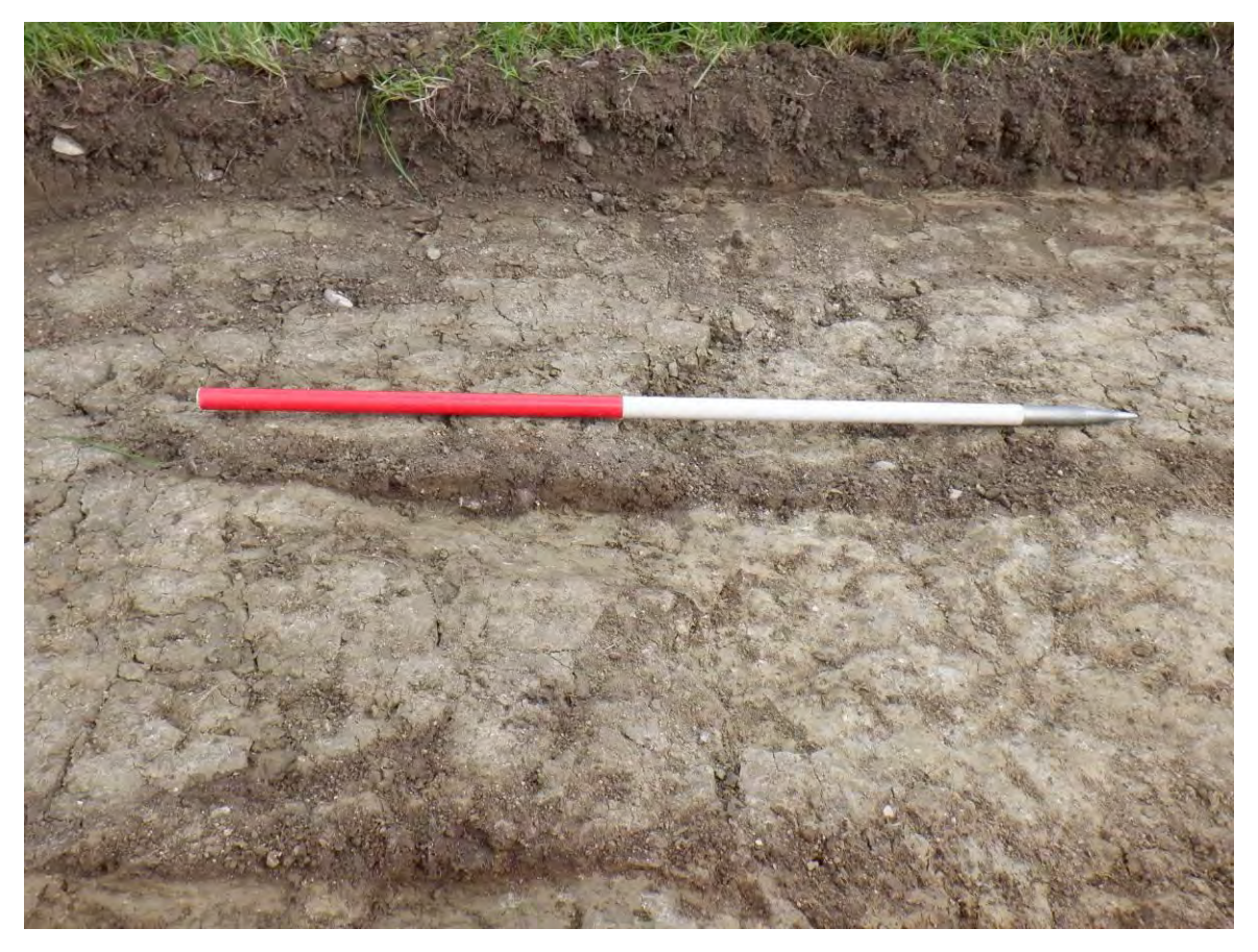
Plate 49. S-facing section of ploughscar [25004]