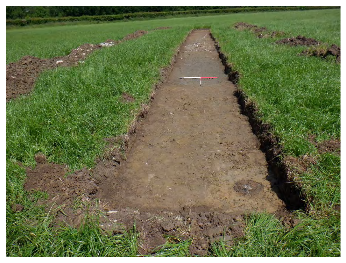
Plate 35. NW-facing shot of Trench 21