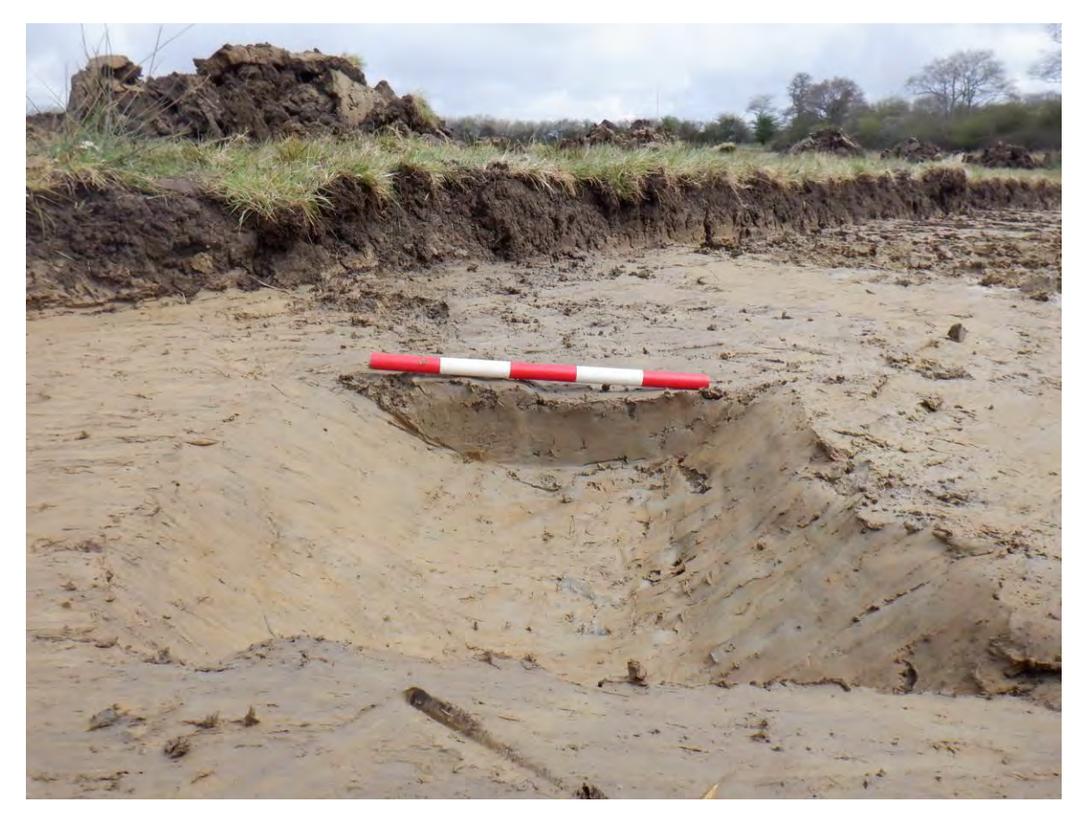
Plate 68. NE-facing section of linear [3503]