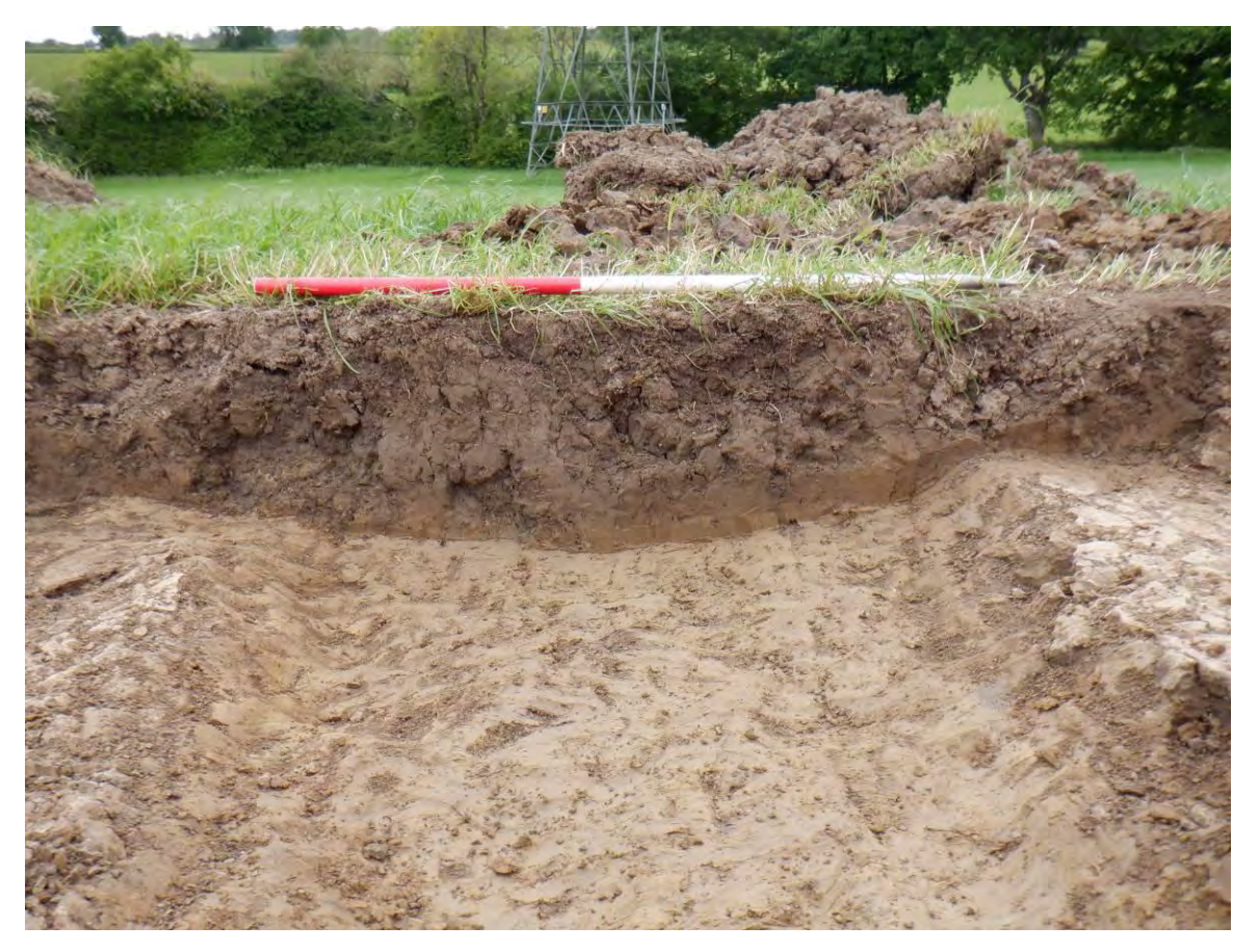
Plate 25. SSE-facing representative section of Trench 13 and linear [14003]