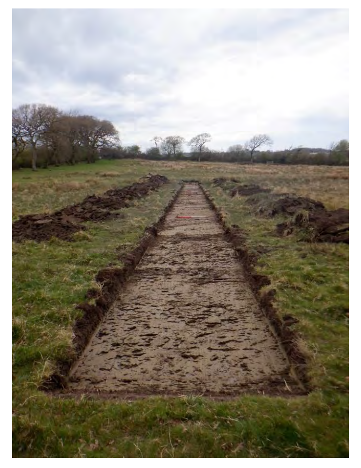
Plate 61. W-facing shot of Trench 32