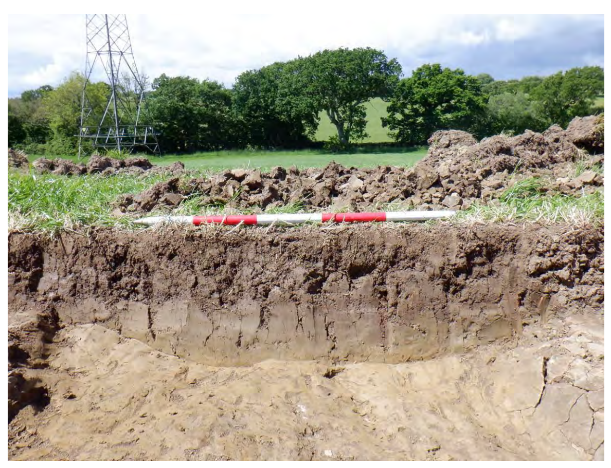
Plate 26. SSE-facing representative section of Trench 14 and linear [14005]