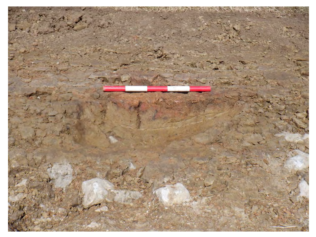
Plate 40. E-facing section of pit [21011]