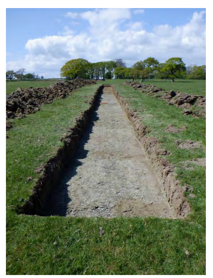
Plate 80. NW-facing shot of Trench 44