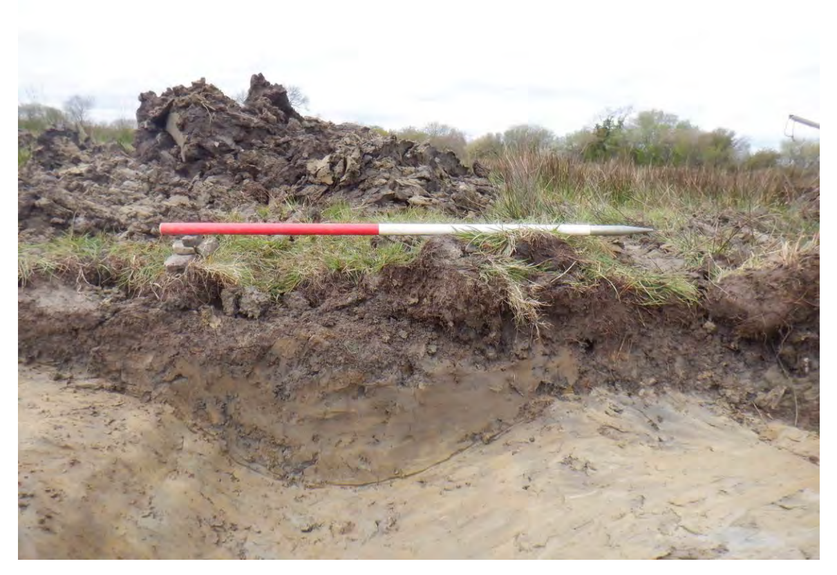
Plate 70. NW-facing representative section of Trench 36 and linear [3603]