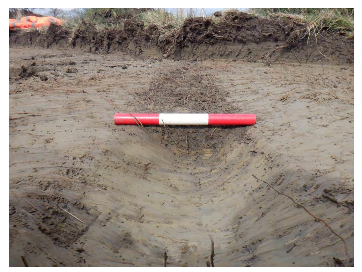
Plate 62. NE-facing section of linear [3204]