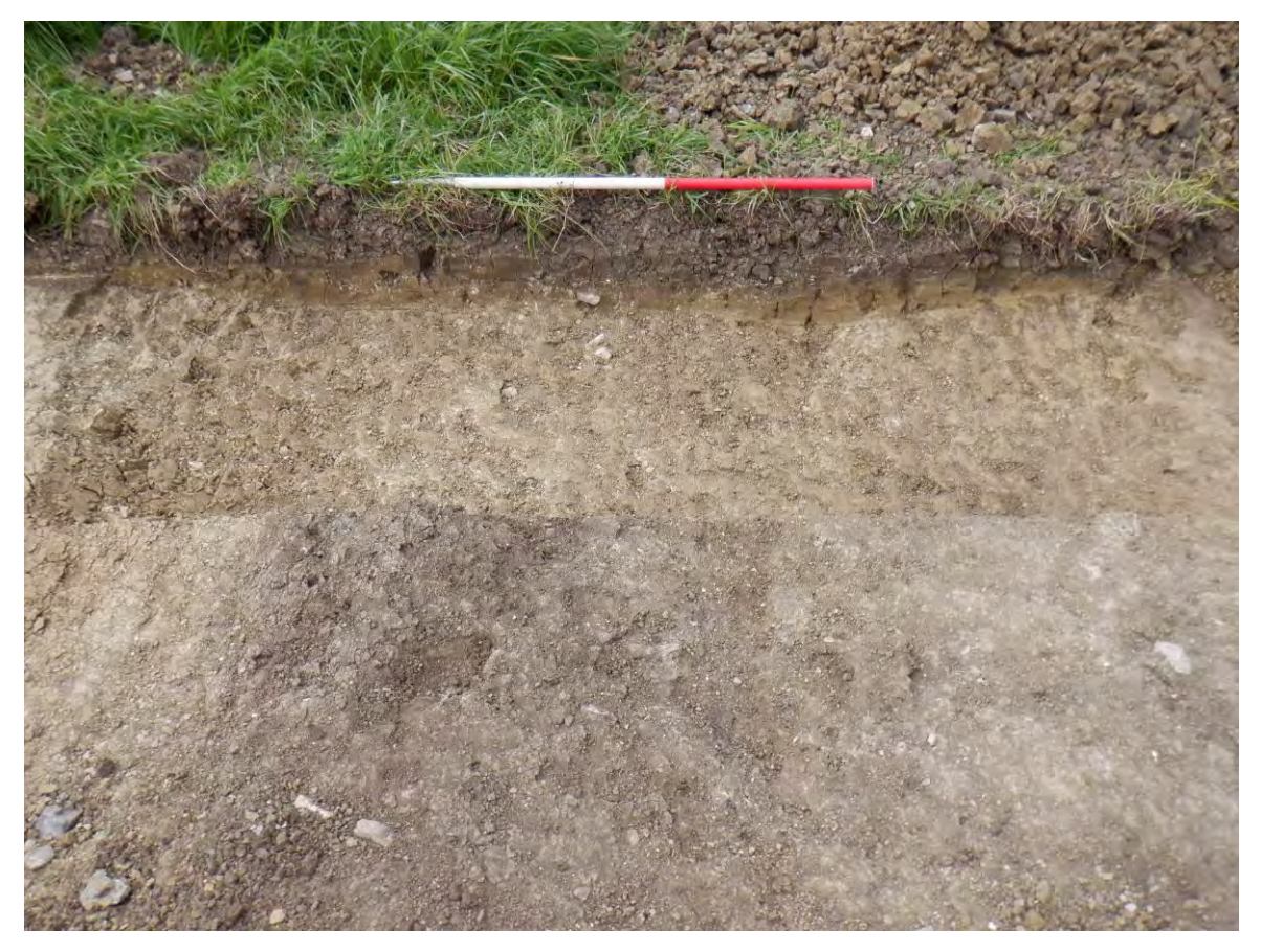
Plate 51. SSE-facing section of linear [25013]