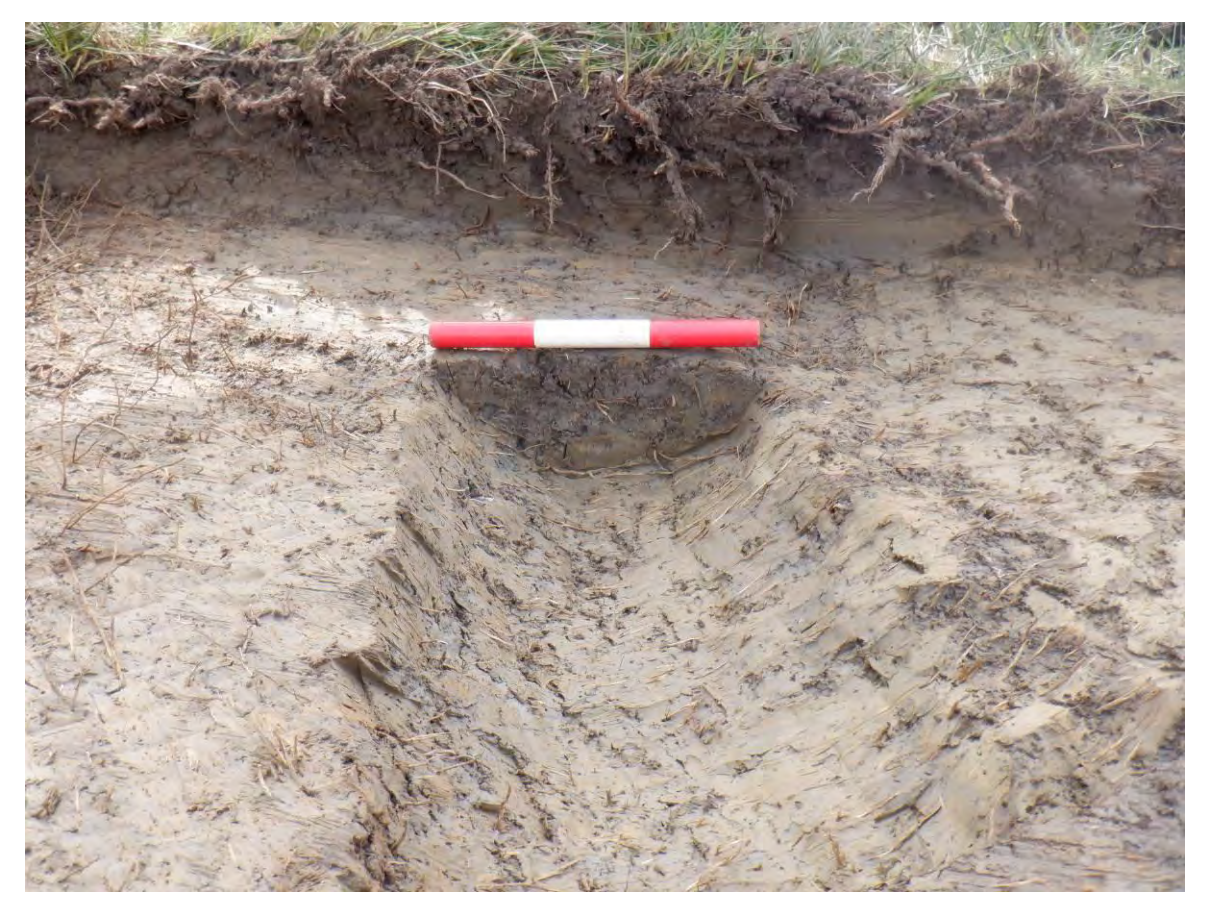
Plate 63. NE-facing section of linear [3206]