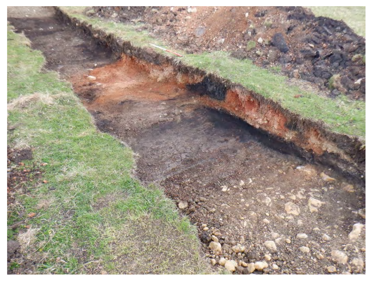
Plate 54. Oblique shot of W-facing section of [2703]