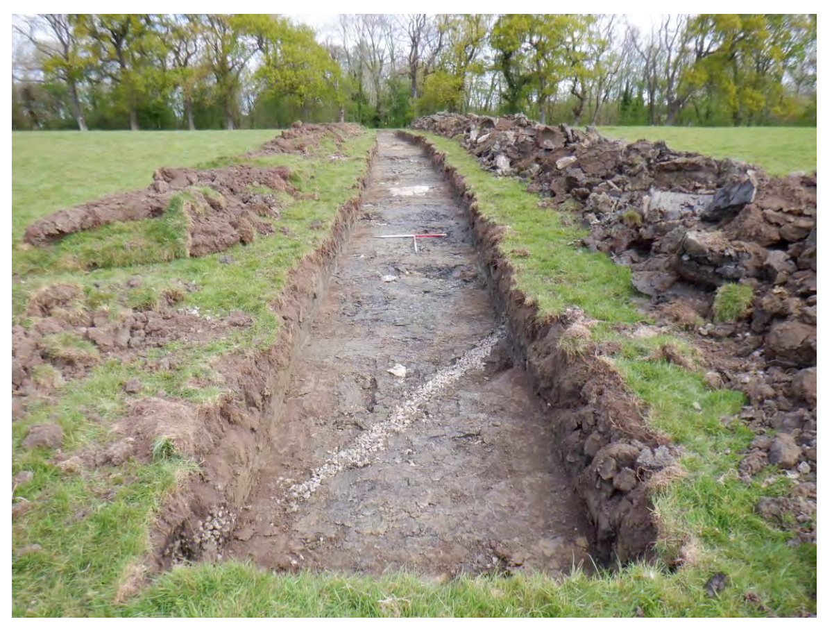
Plate 79. N-facing shot of Trench 43