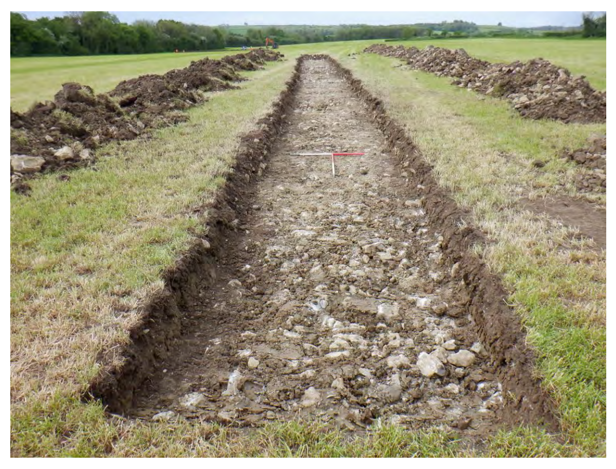
Plate 29. SW-facing shot of Trench 17