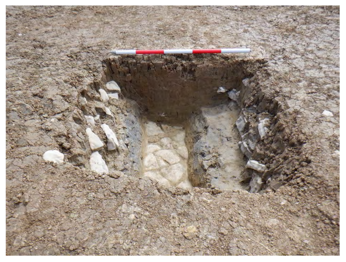
Plate 39. WSW-facing section of ditch [21008]