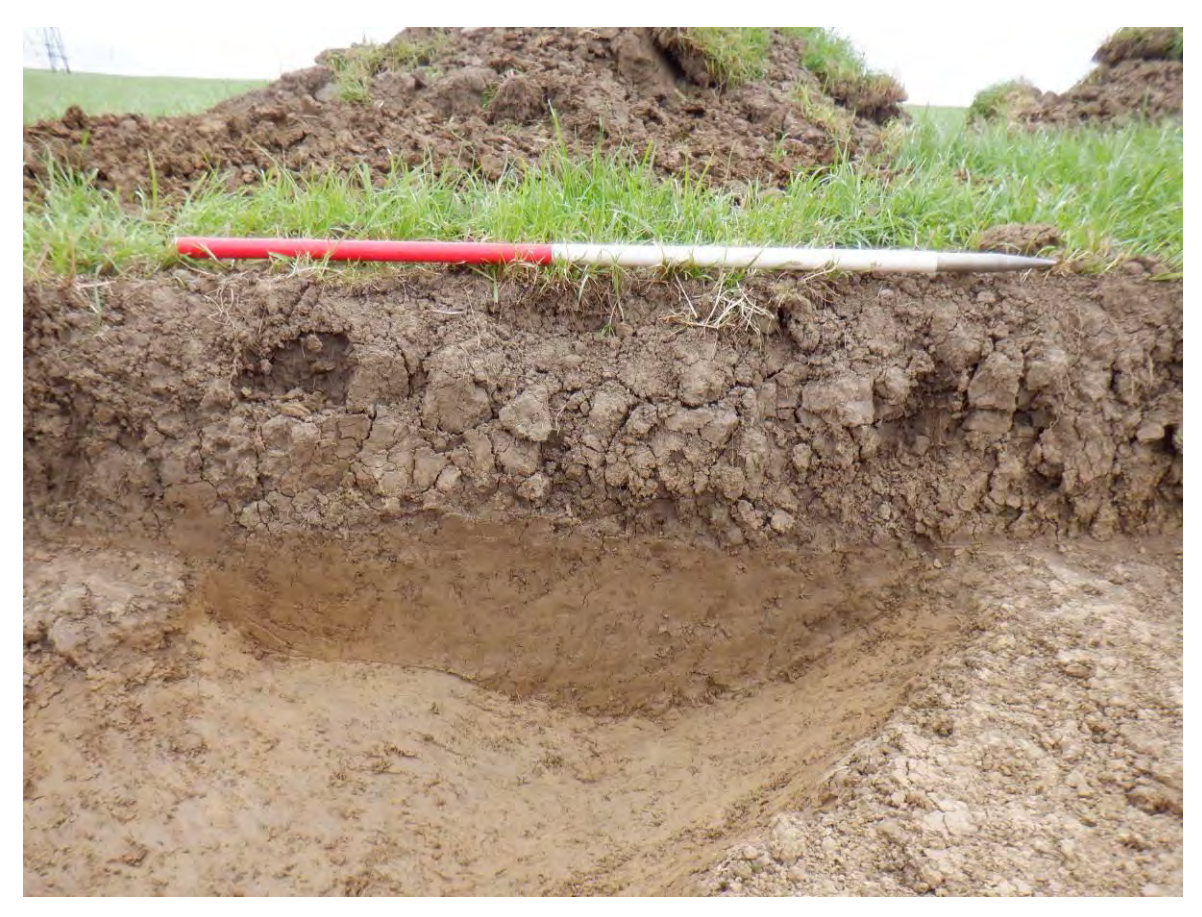
Plate 28. NW-facing representative section of Trench 15 and Linear [15003]