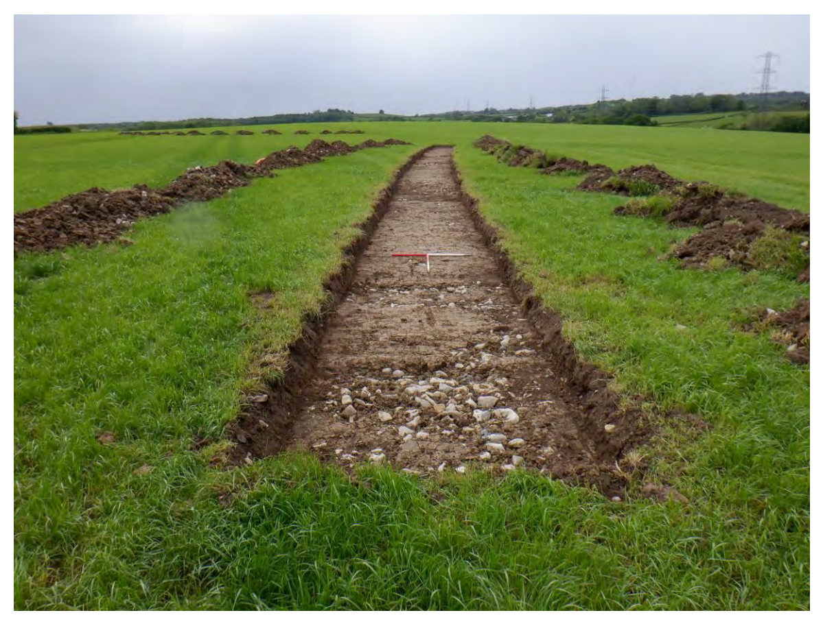
Plate 31. W-facing shot of Trench 18