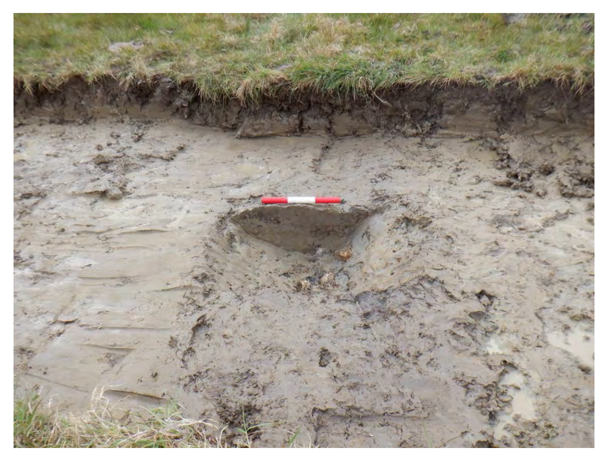
Plate 66. S-facing section of linear [3403]