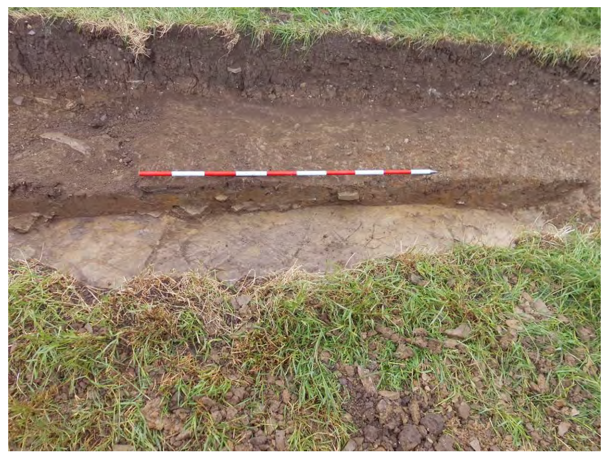
Plate 43. NW-facing section of [23003]