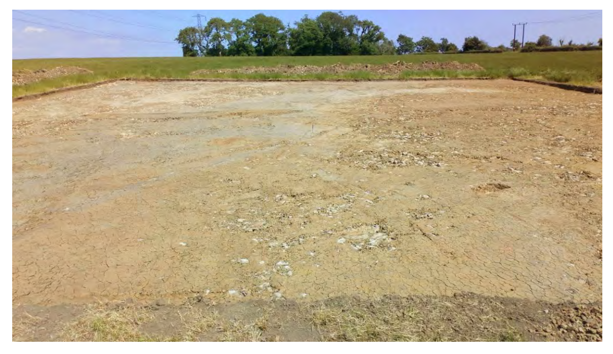
Plate 36. S-facing shot of Trench 21 extension