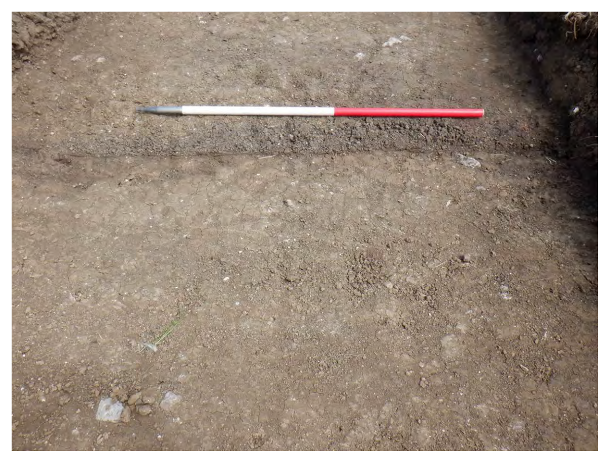
Plate 45. S-Facing section of ploughscar [24004]