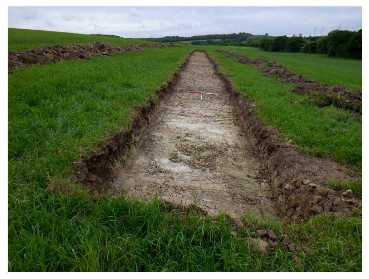
Plate 24. WSW-facing shot of Trench 14