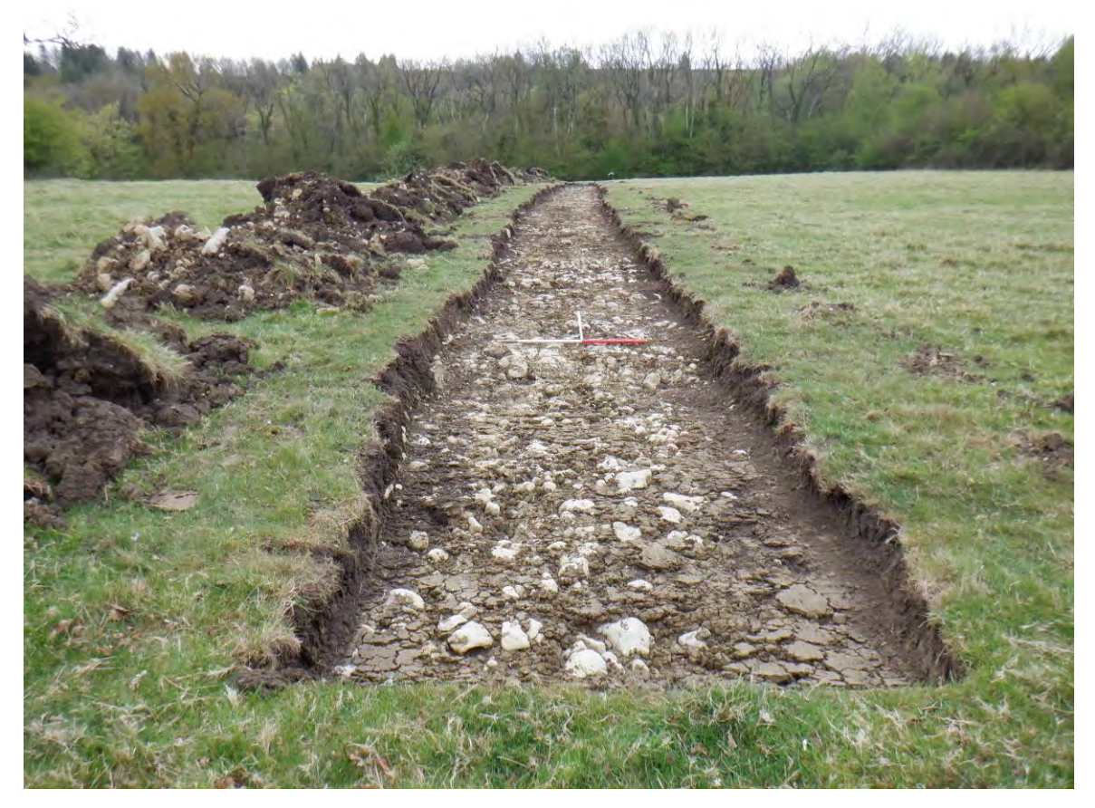
Plate 52. SSE-facing shot of Trench 26