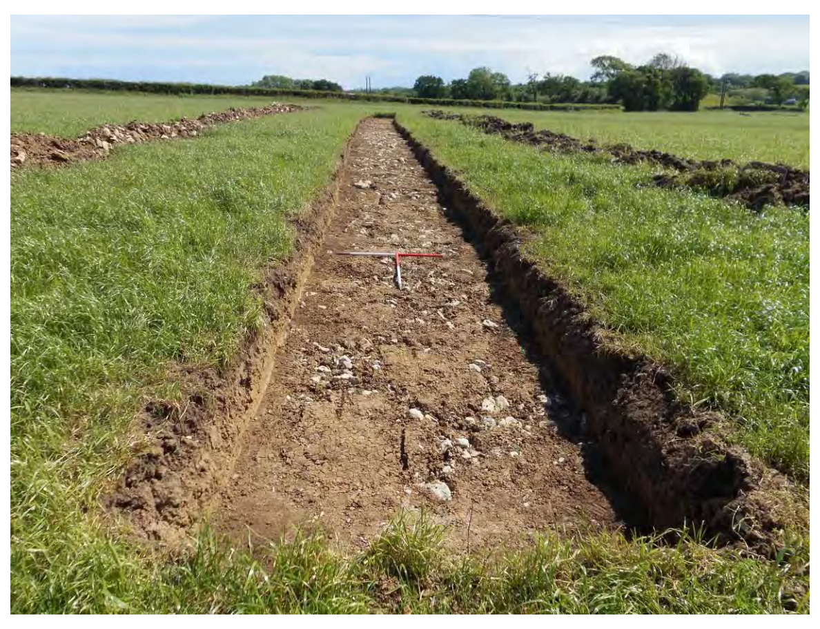
Plate 33. SE-facing shot of Trench 20