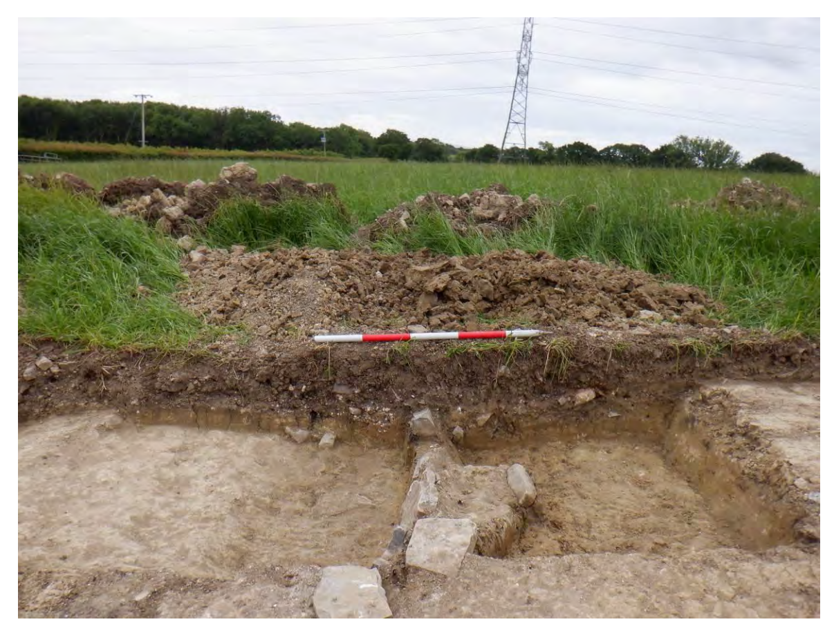
Plate 50. N-facing section of stone drains [25011] and [25016]