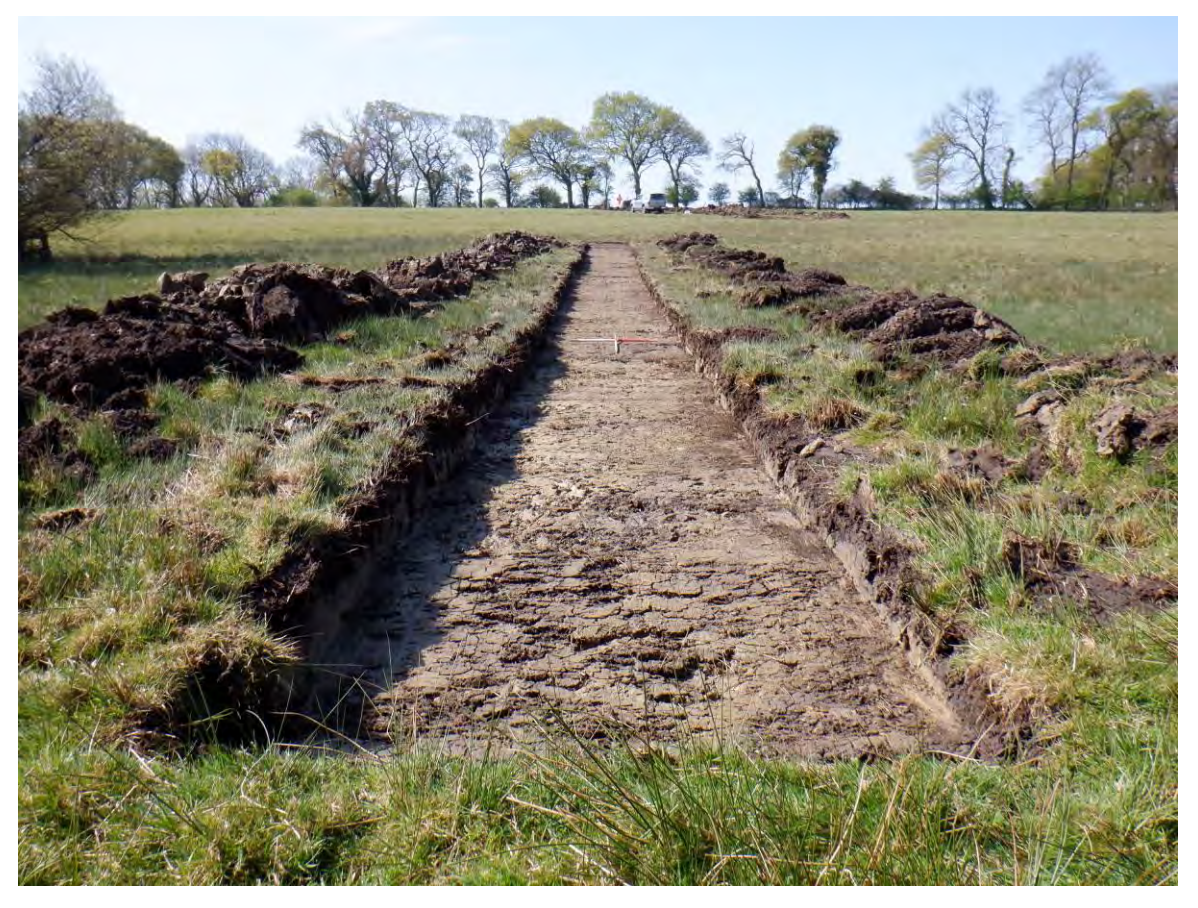
Plate 59. SW-facing shot of Trench 30