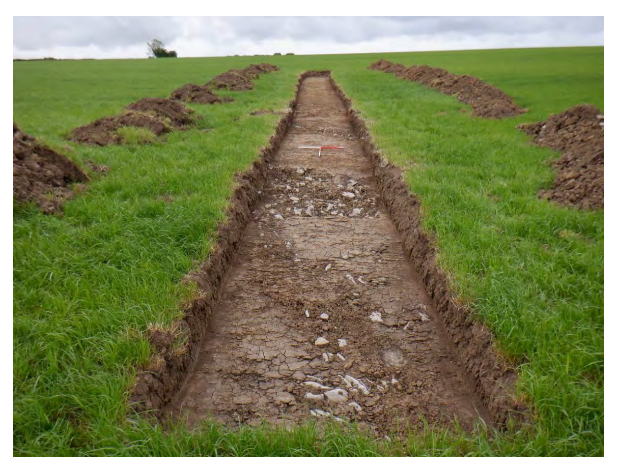
Plate 27. S-facing shot of Trench 15