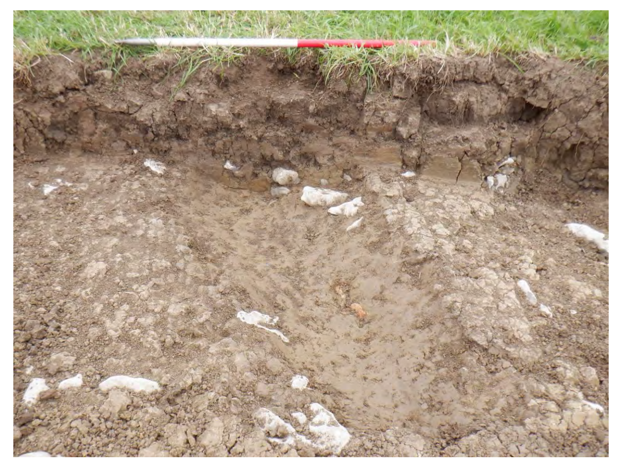
Plate 32. N-facing section of linear [18002]