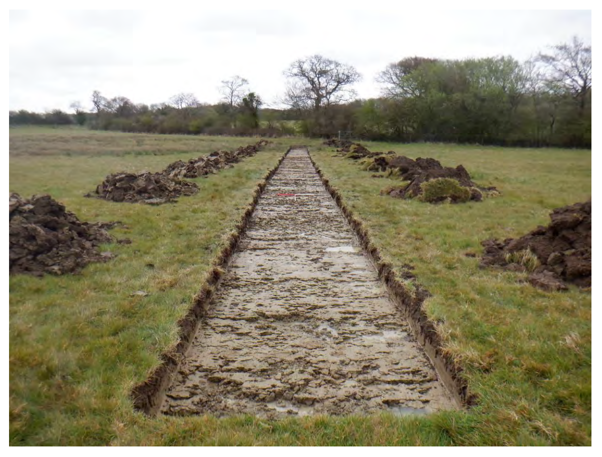
Plate 67. E-facing shot of Trench 35