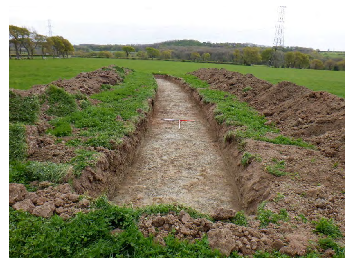
Plate 78. SE-facing shot of Trench 40