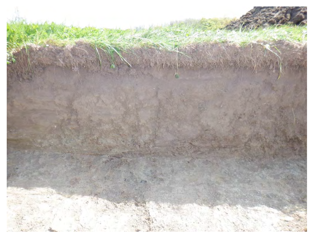
Plate 77. N-facing representative section of Trench 39 and linear [3903]