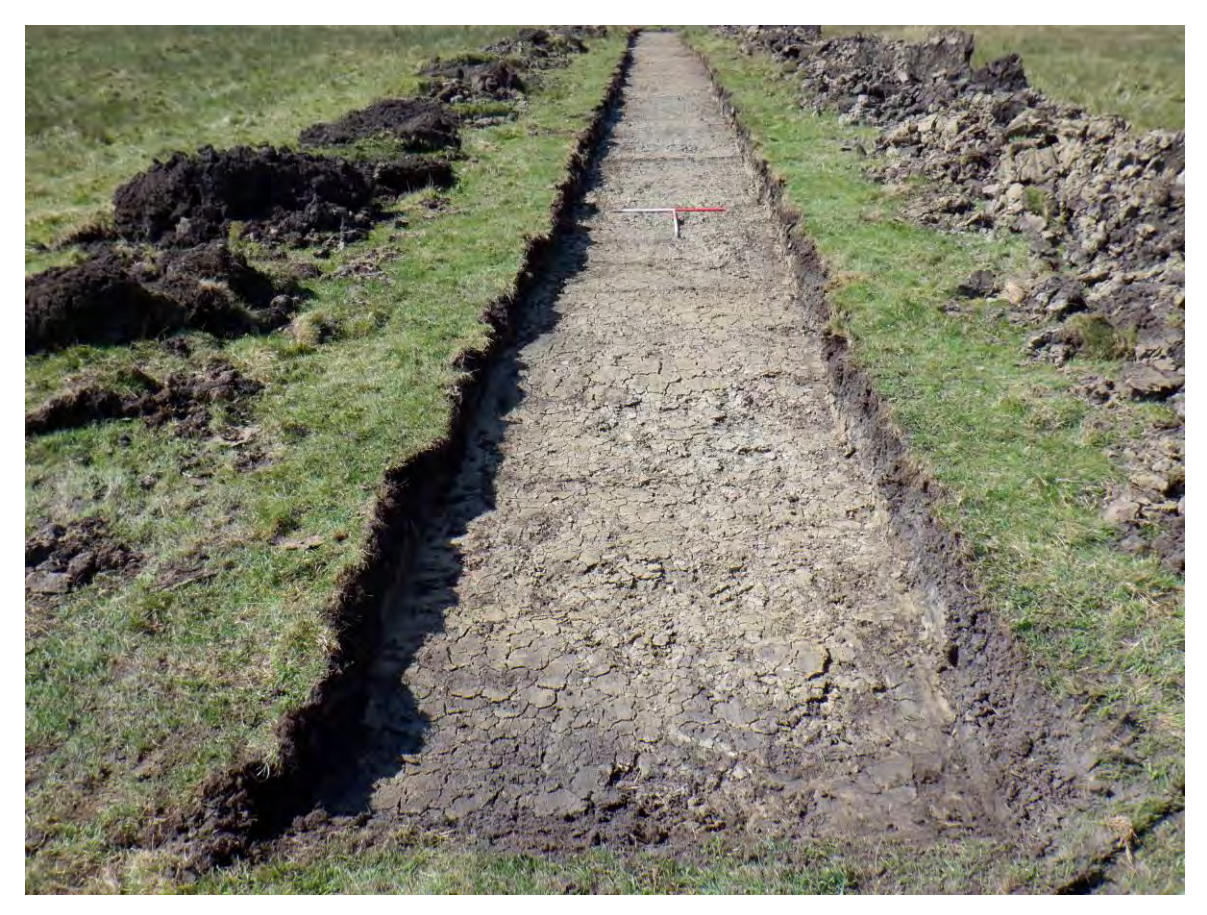
Plate 58. ENE-facing shot of Trench 31