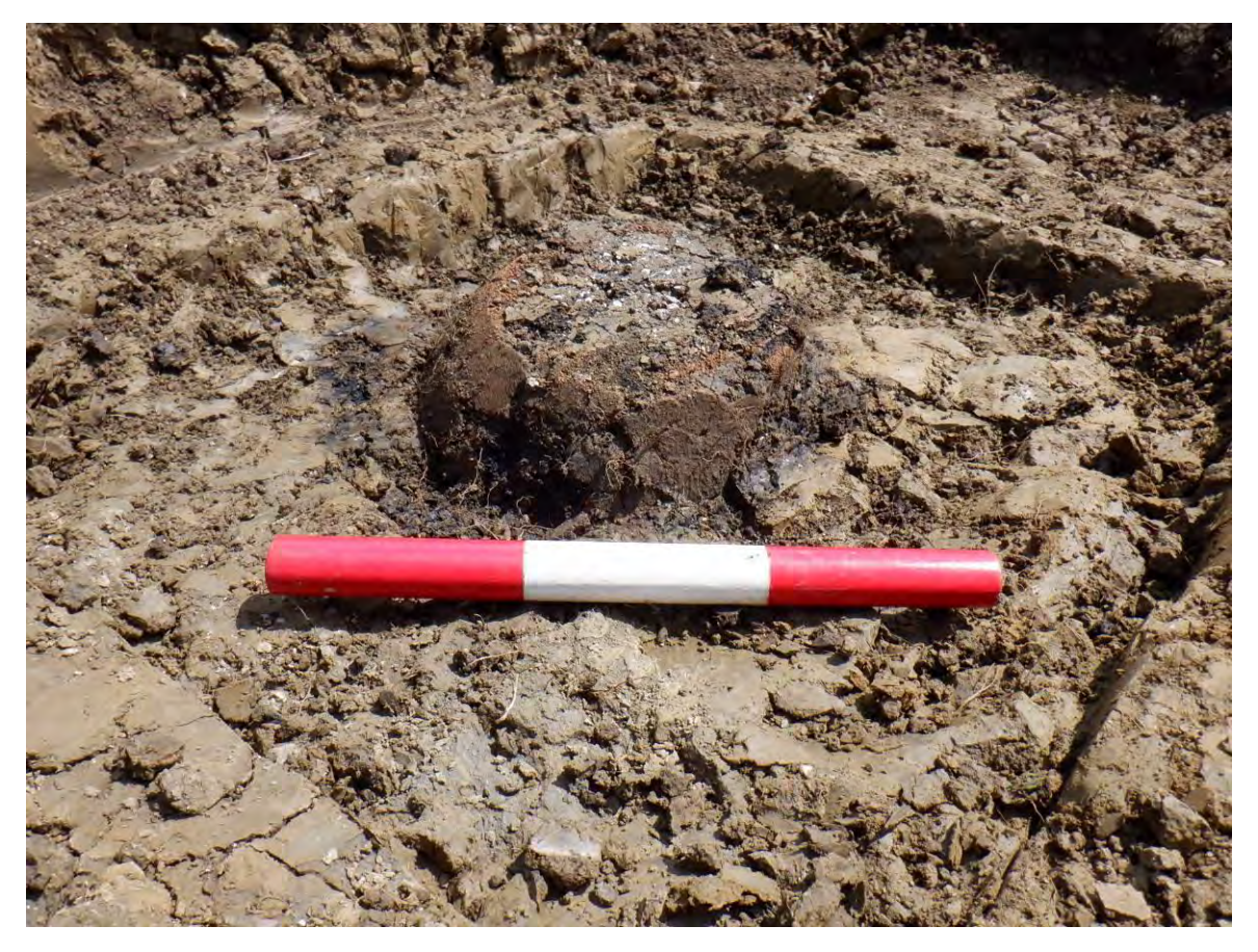
Plate 38. SW-shot of stage 1, cremation removal