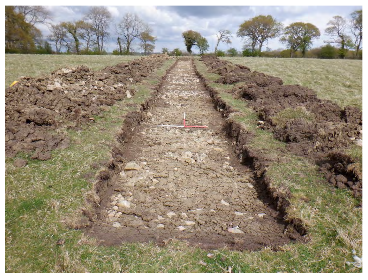
Plate 55. E-facing shot of Trench 28