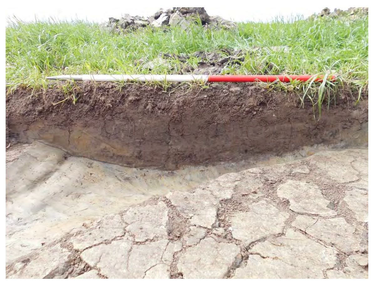
Plate 22. N-facing representative section of Trench 13 and linear [13003]