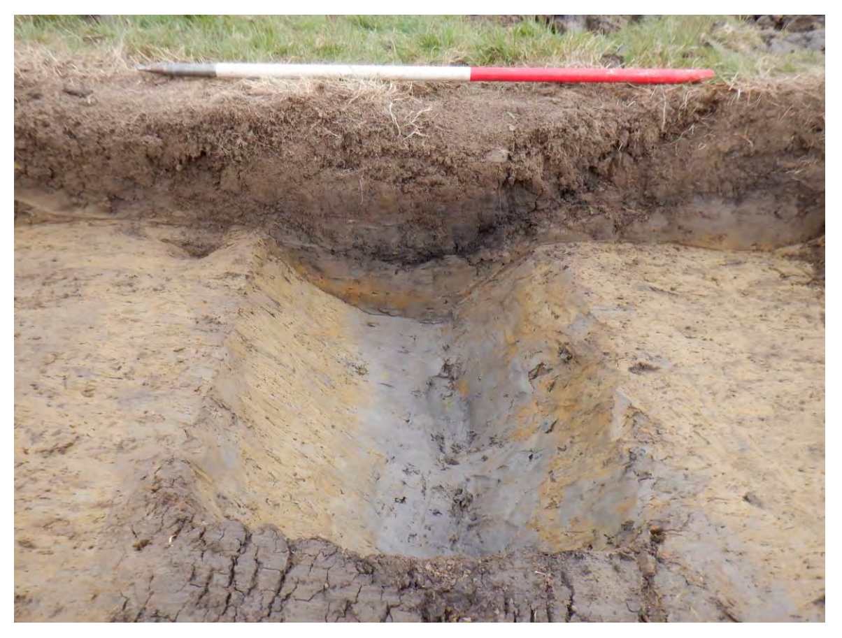
Plate 73. W-facing representative section of Trench 37 and linear [3707]