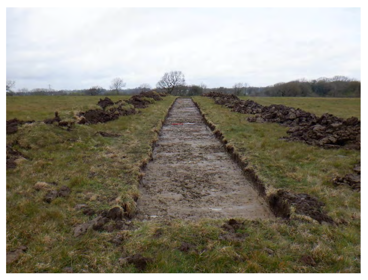
Plate 65. W-facing shot of Trench 34