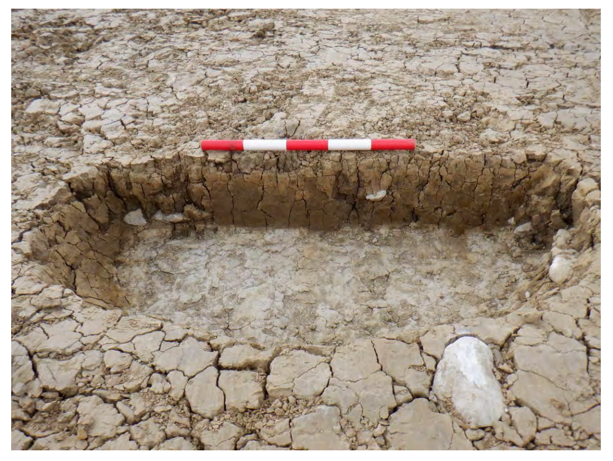
Plate 41. NE-facing section of pit [21015]