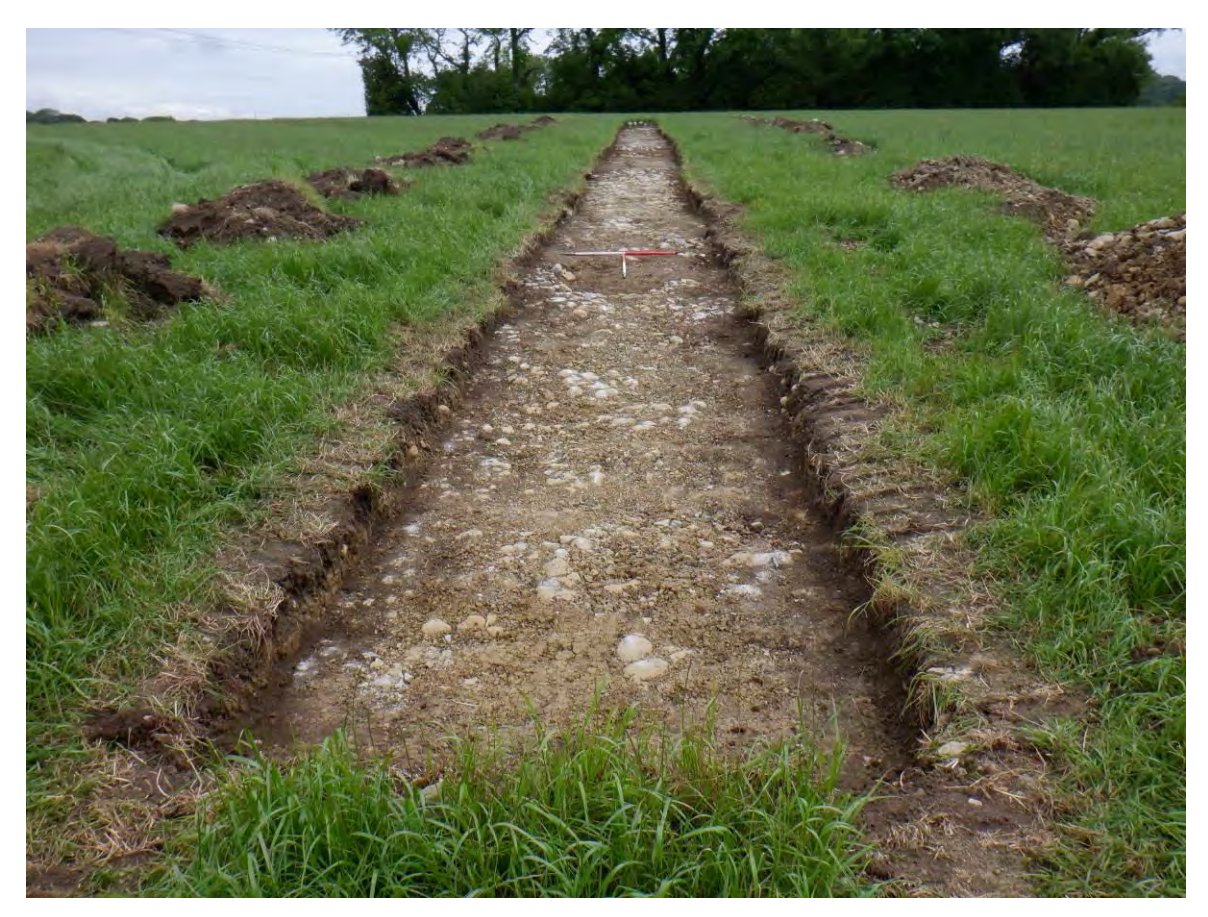
Plate 30. E-facing shot of Trench 22