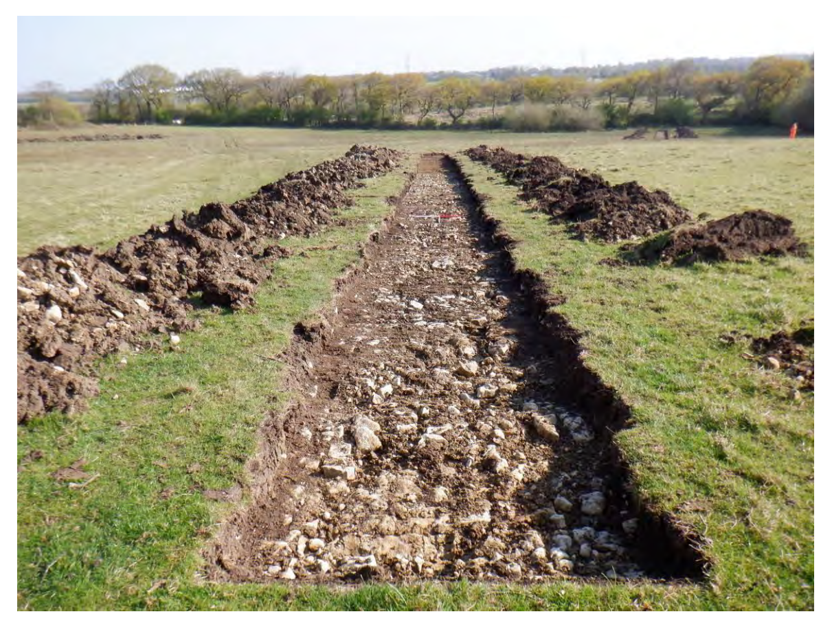
Plate 57. N-facing shot of Trench 29