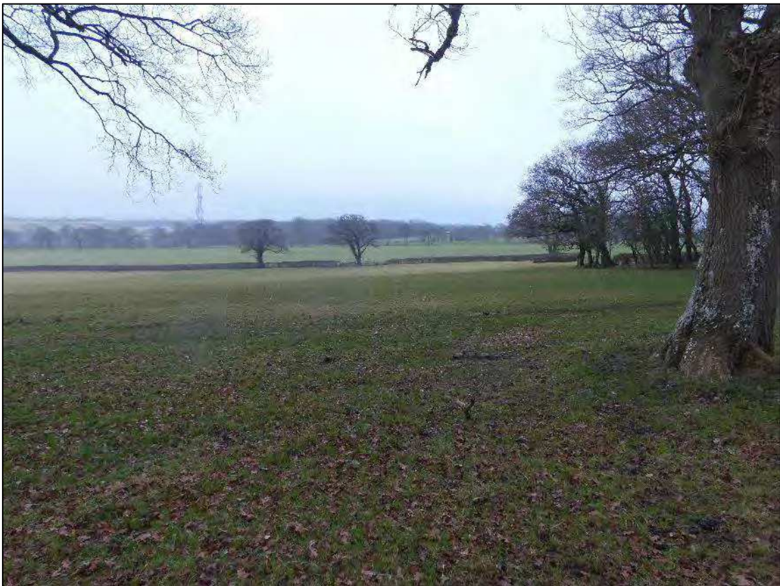
Plate 28. Area 2: approximate area of GGAT03874s, facing south-west