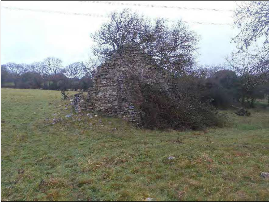
Plate 35. Area 2: Remain of Brook Farm (NPRN 414419; GGAT03879s; GGAT03880s; GGAT03881s)