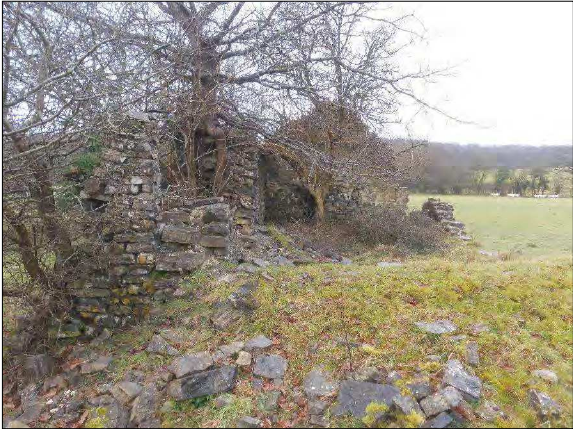
Plate 32. Area 2: Remain of Brook Farm (NPRN 414419; GGAT03879s; GGAT03880s; GGAT03881s)