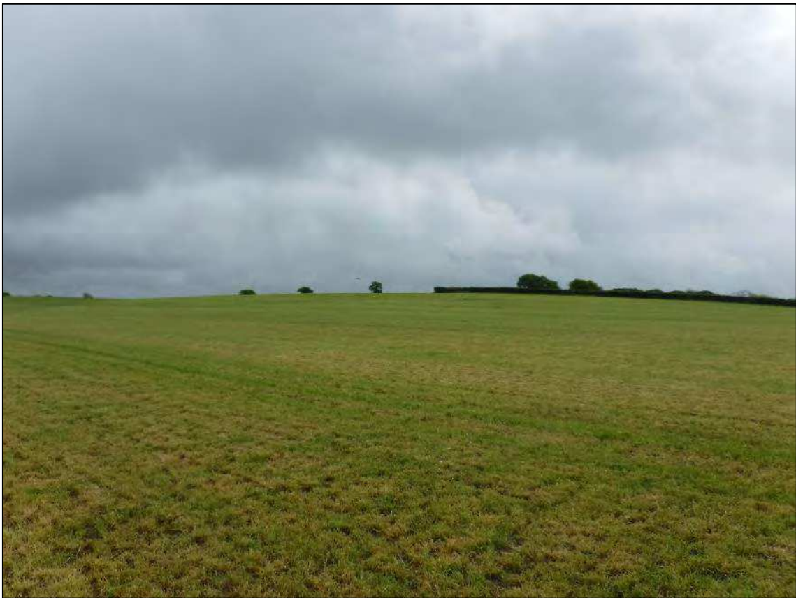
Plate 8. Area 1, facing south-east