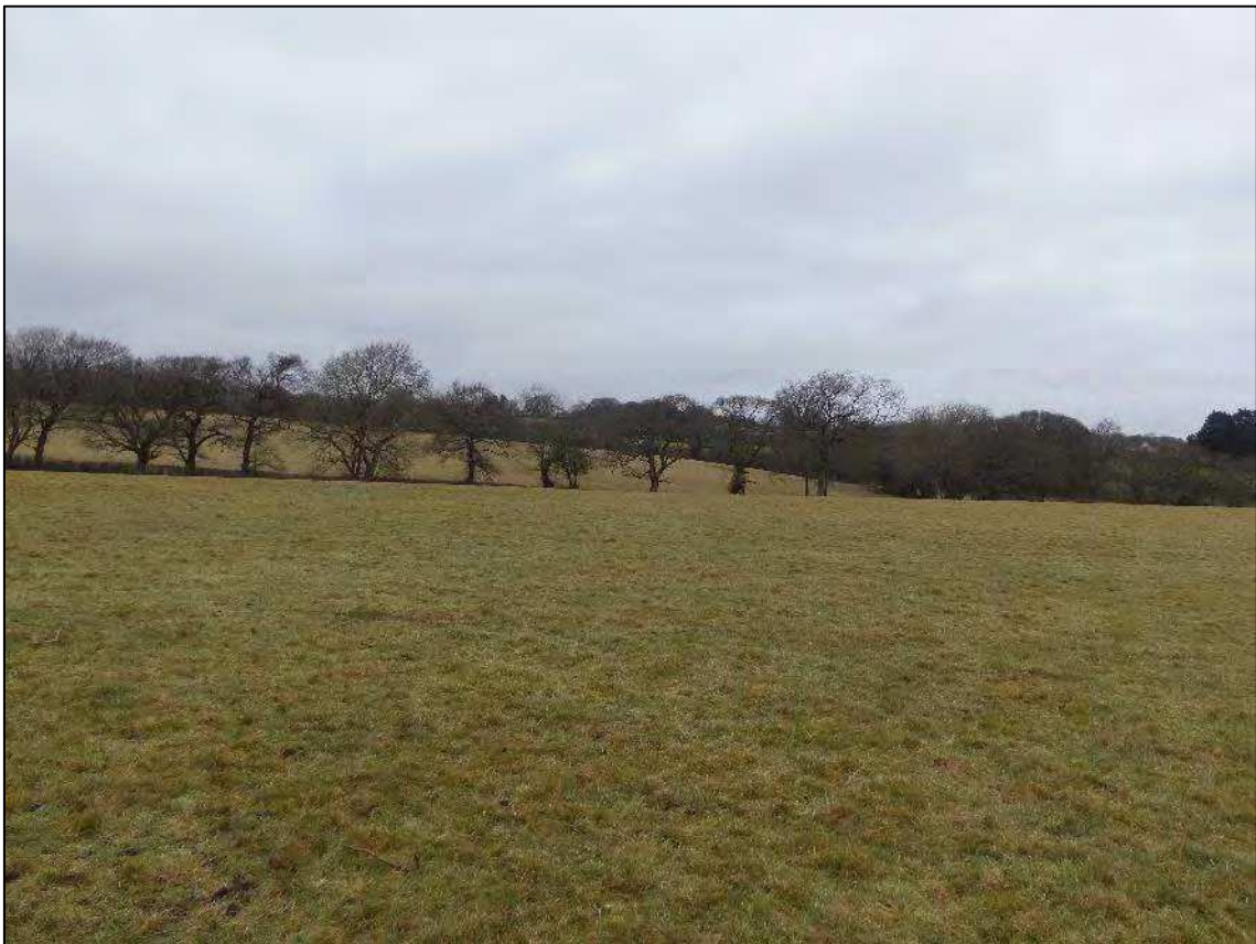
Plate 40. Area 2: location of recorded parch marks (NPRN 422326), looking north-east