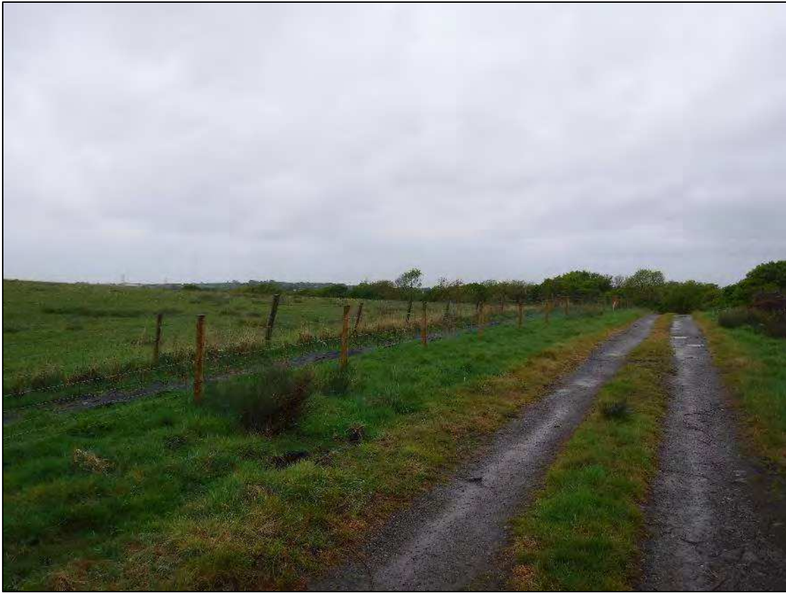
Plate 3. Southern area of Area 3, trackway leading north-east