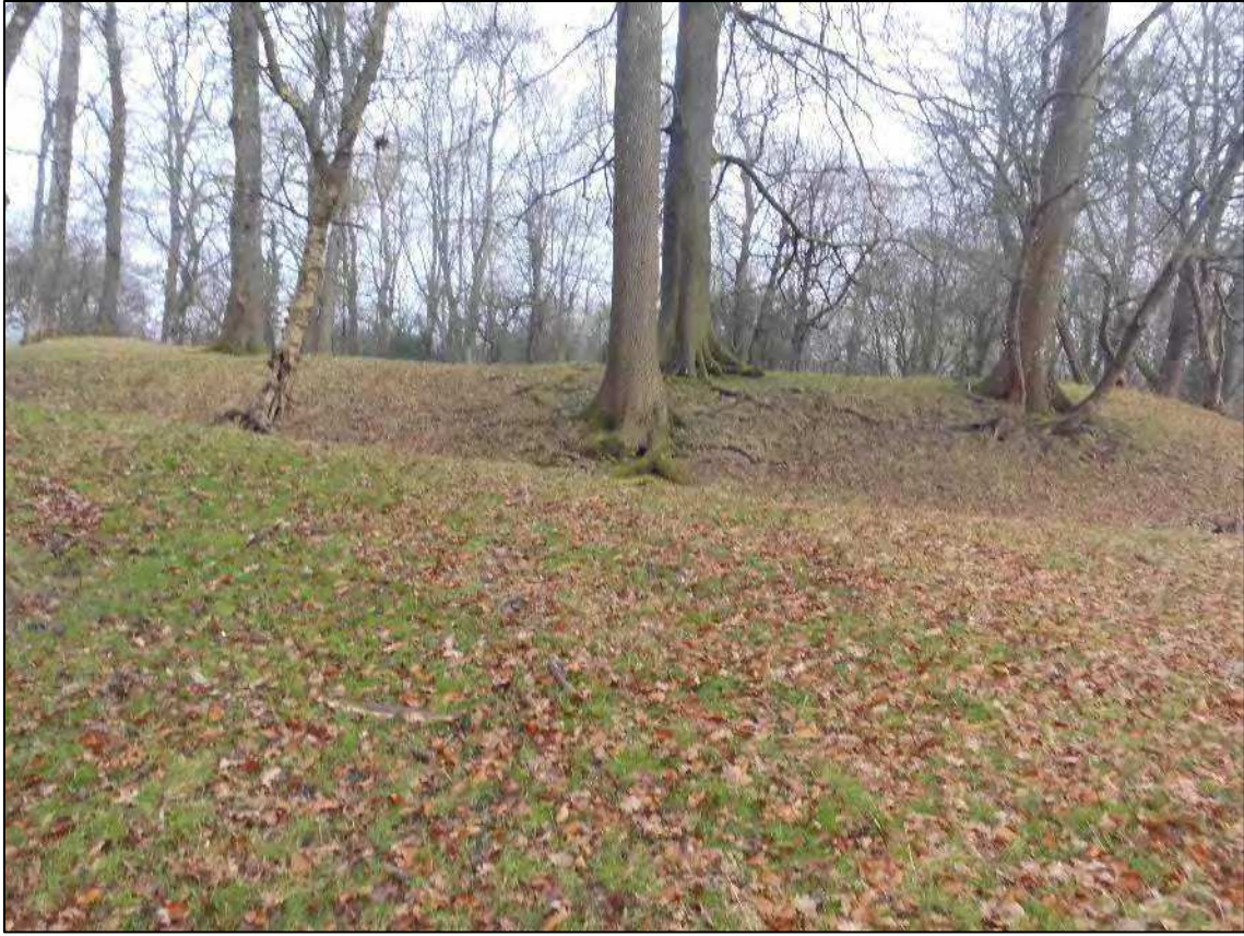
Plate 23. Area 2: Scheduled Monument GM117, facing north