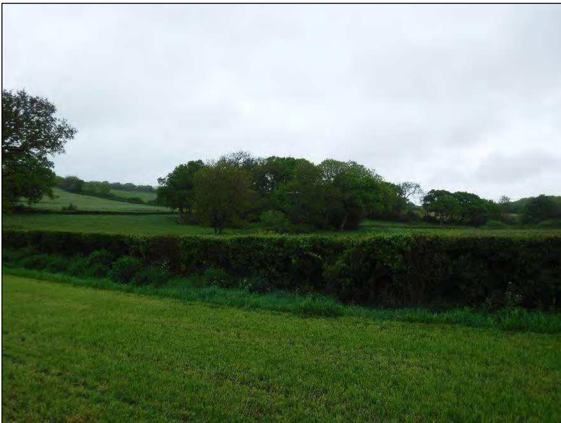
Plate 20. Area 1: Scheduled Monument GM613, facing north-east