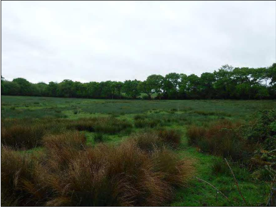
Plate 5. Area 3, facing south towards Coed Quinnet woods