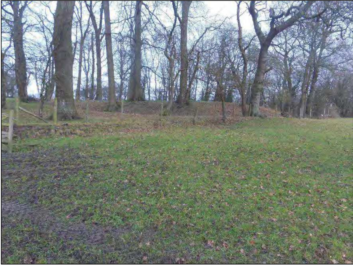
Plate 24. Area 2: GM117 from within the proposed site, facing north-east