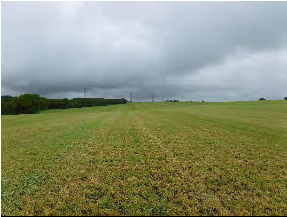
Plate 7. Area 1, facing north-east