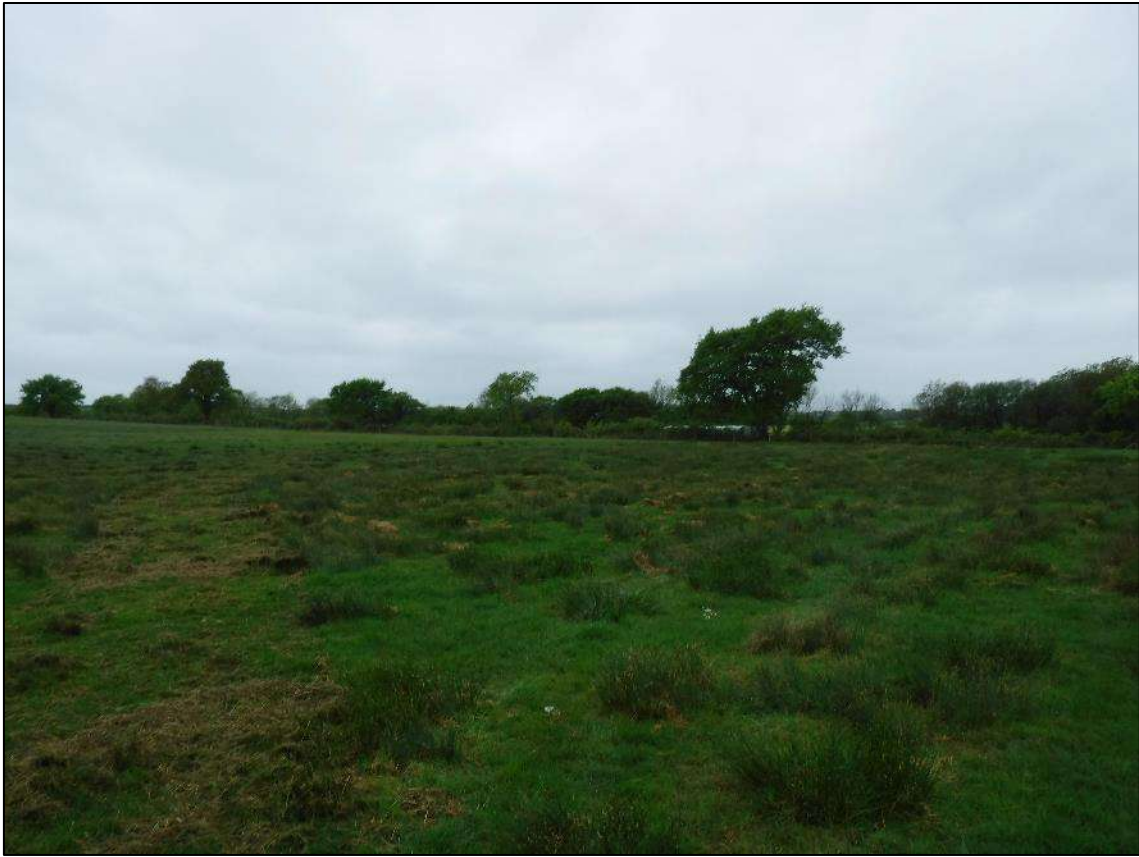
Plate 1. Southern area of Area 3, facing south-east