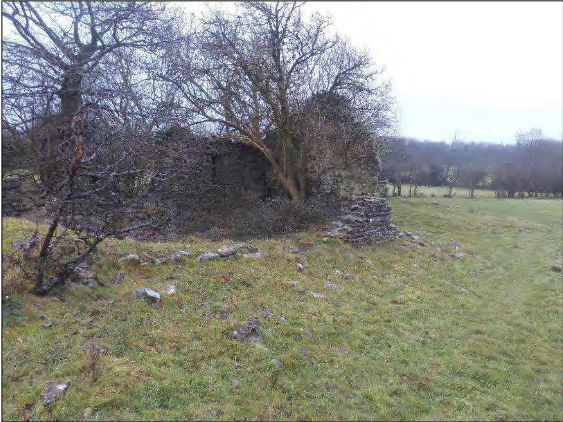
Plate 34. Area 2: Remain of Brook Farm (NPRN 414419; GGAT03879s; GGAT03880s; GGAT03881s)