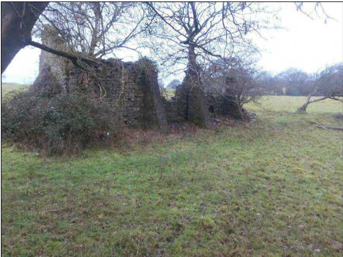
Plate 36. Area 2: Remain of Brook Farm (NPRN 414419; GGAT03879s; GGAT03880s; GGAT03881s)