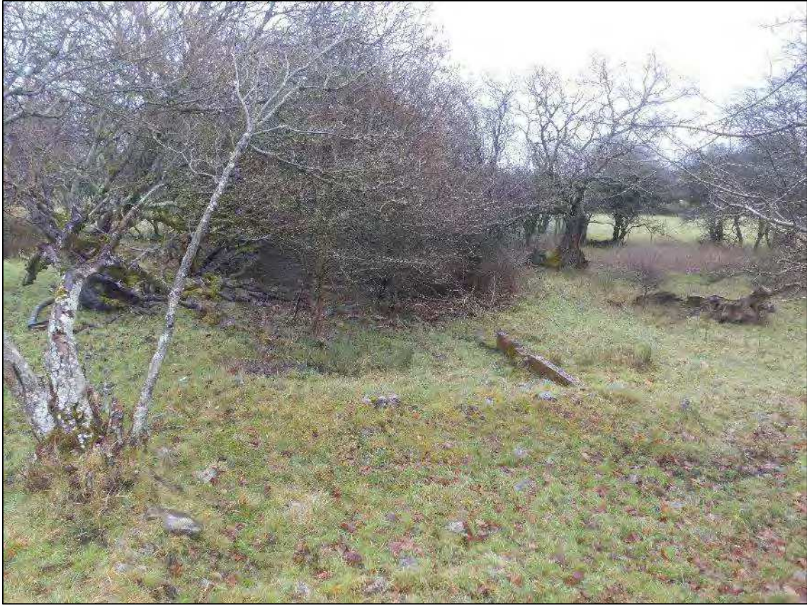
Plate 33. Area 2: Remain of Brook Farm (NPRN 414419; GGAT03879s; GGAT03880s; GGAT03881s)