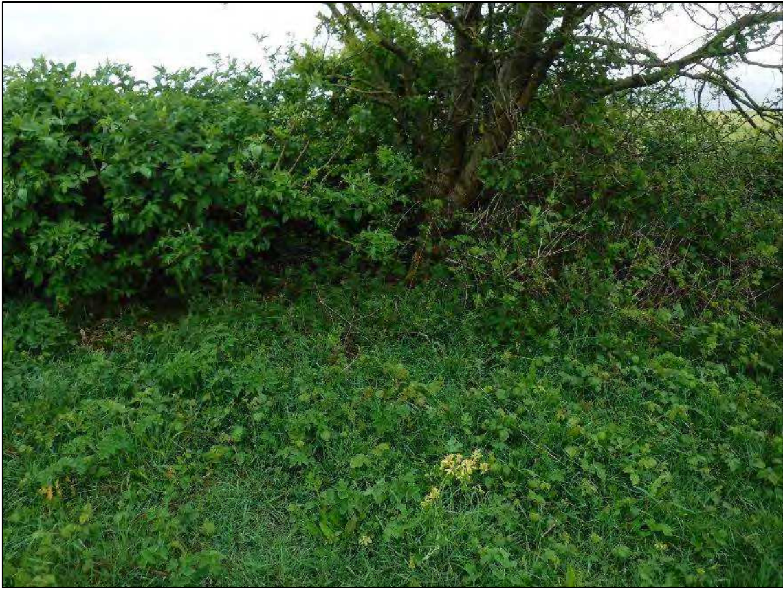
Plate 13. Area 1: location of post-medieval quarry/limekiln OFV02, facing north