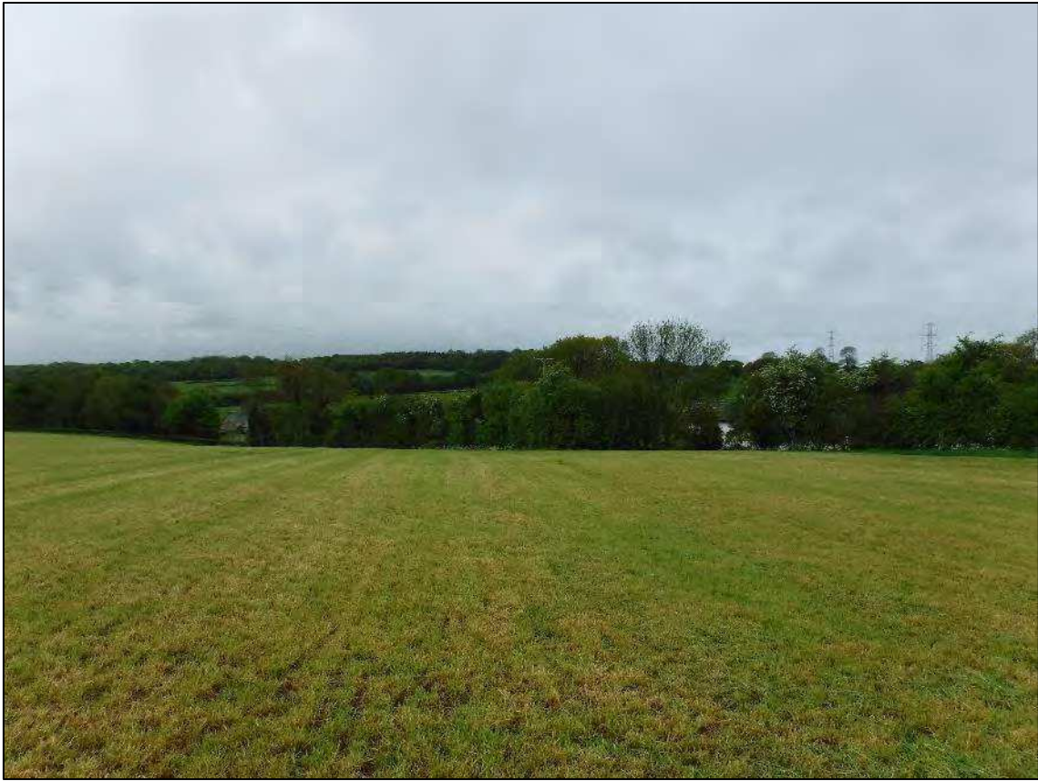
Plate 9. Area 1, facing west