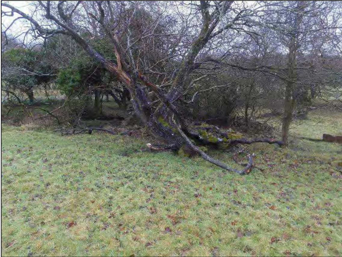
Plate 30. Area 2: Remain of Brook Farm (NPRN 414419; GGAT03879s; GGAT03880s; GGAT03881s)