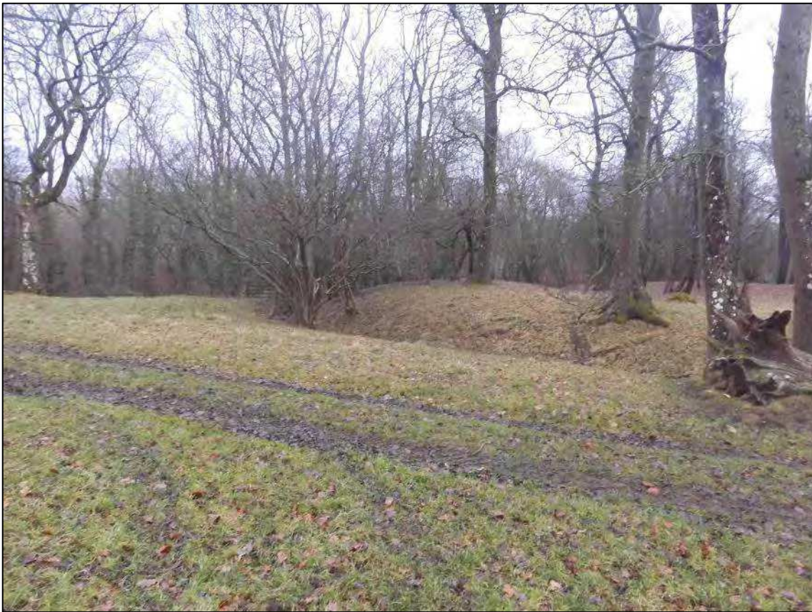
Plate 22. Area 2: Scheduled Monument GM117, facing north-east