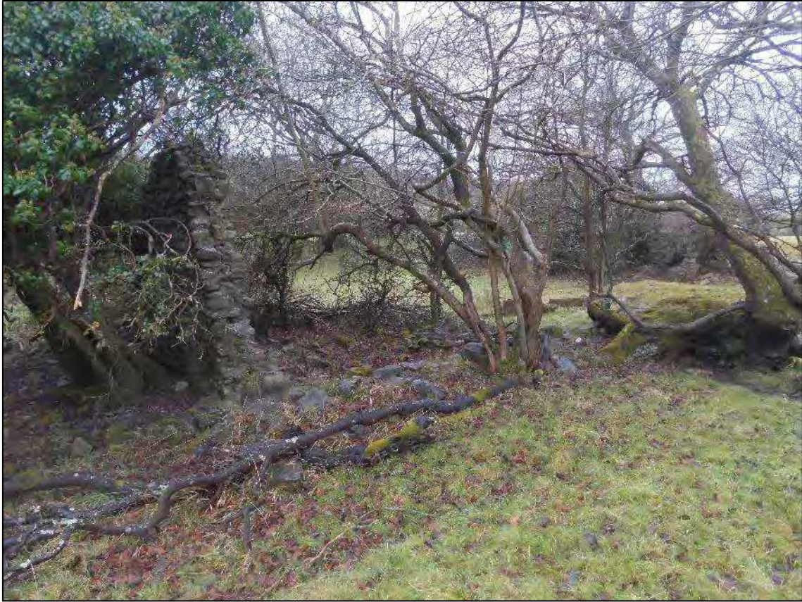
Plate 31. Area 2: Remain of Brook Farm (NPRN 414419; GGAT03879s; GGAT03880s; GGAT03881s)