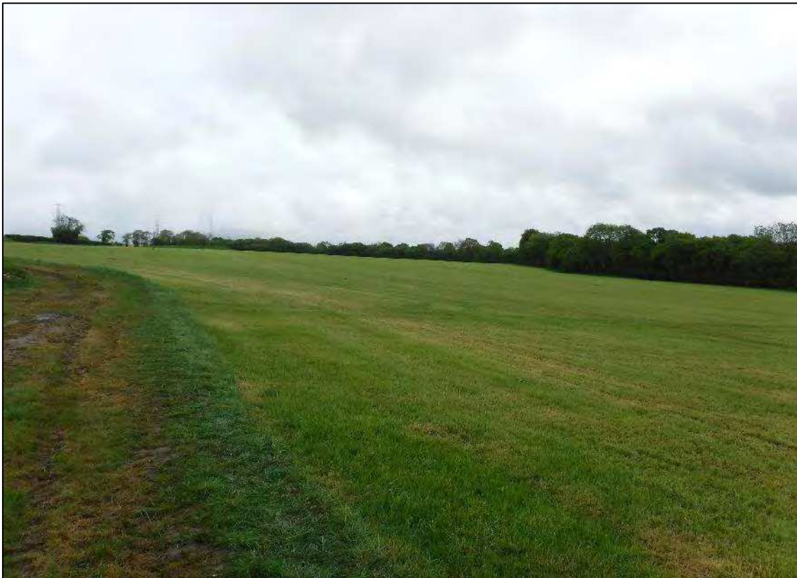
Plate 16. Area 1: location of cropmarks NPRN 309284; GGAT03998s & NPRN 309275, facing north-west