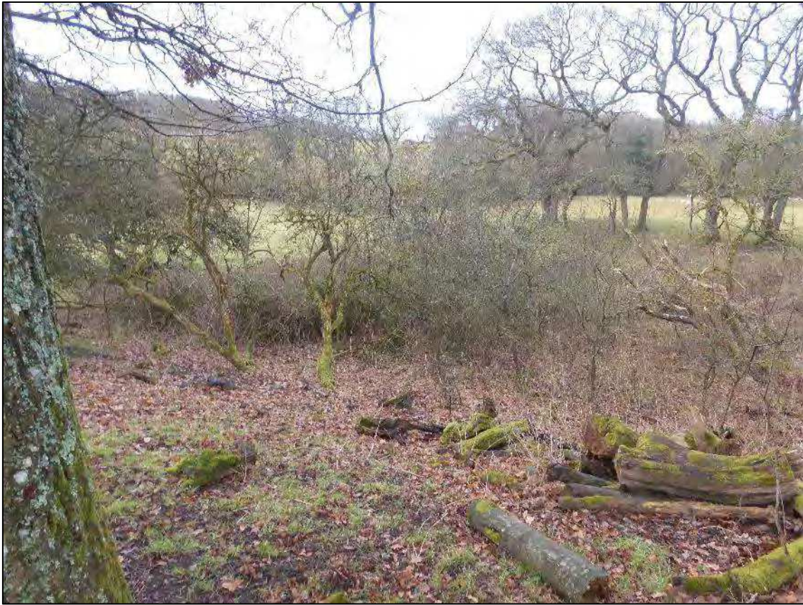
Plate 37. Area 2: looking towards hollow way (GGAT03878s), looking south-west