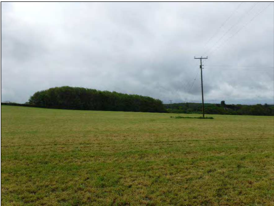
Plate 10. Area 1, facing south