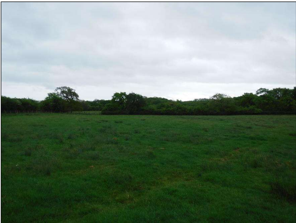
Plate 2. Southern area of Area 3, facing south