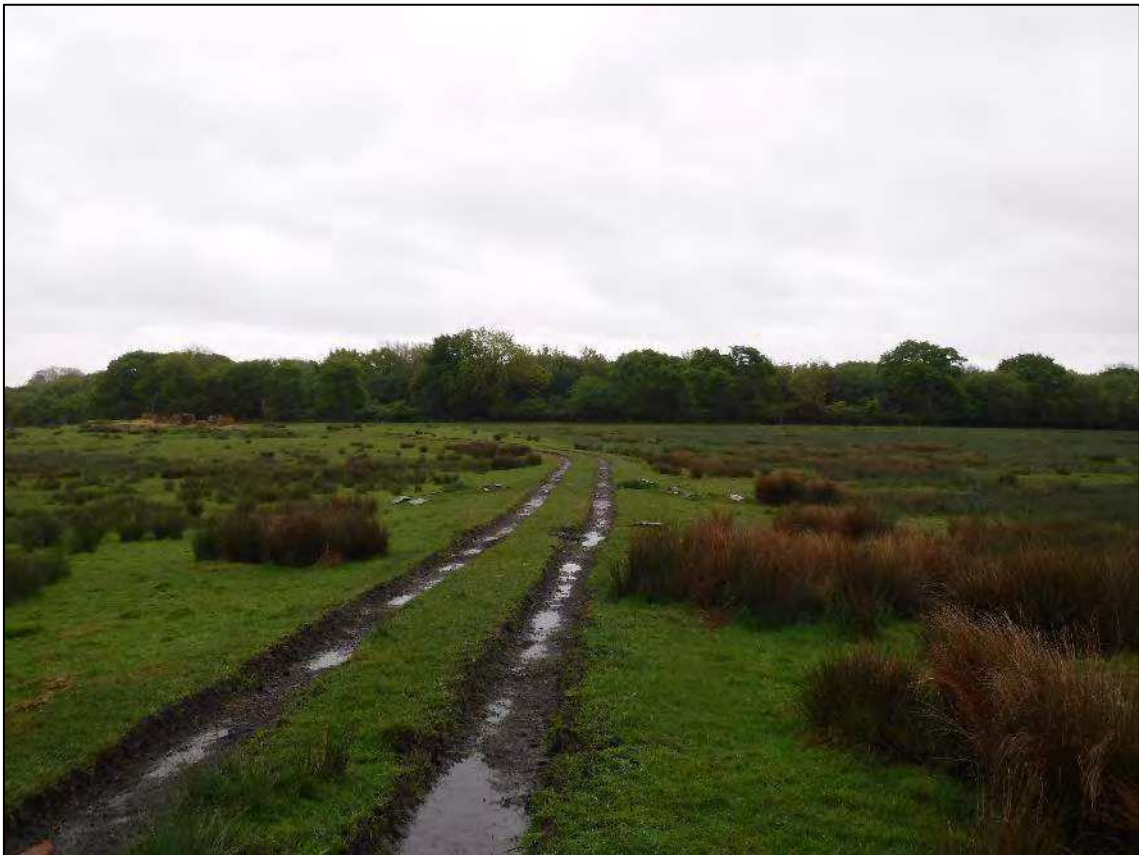
Plate 6. Area 3, facing south-east towards Coed Quinnet woods