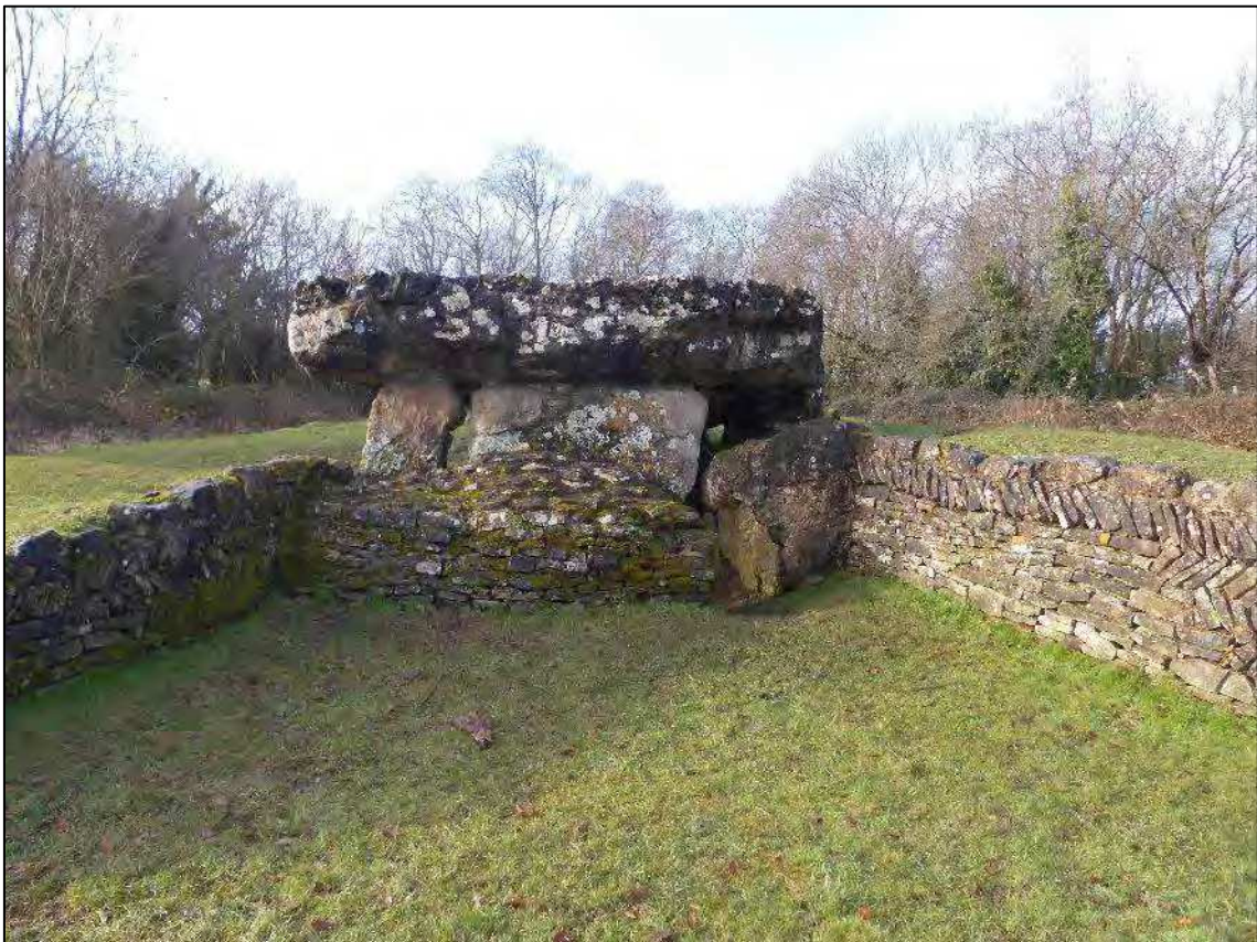
Plate 44. Scheduled Monument - Tinkinswood Burial Chamber (GM009), facing west