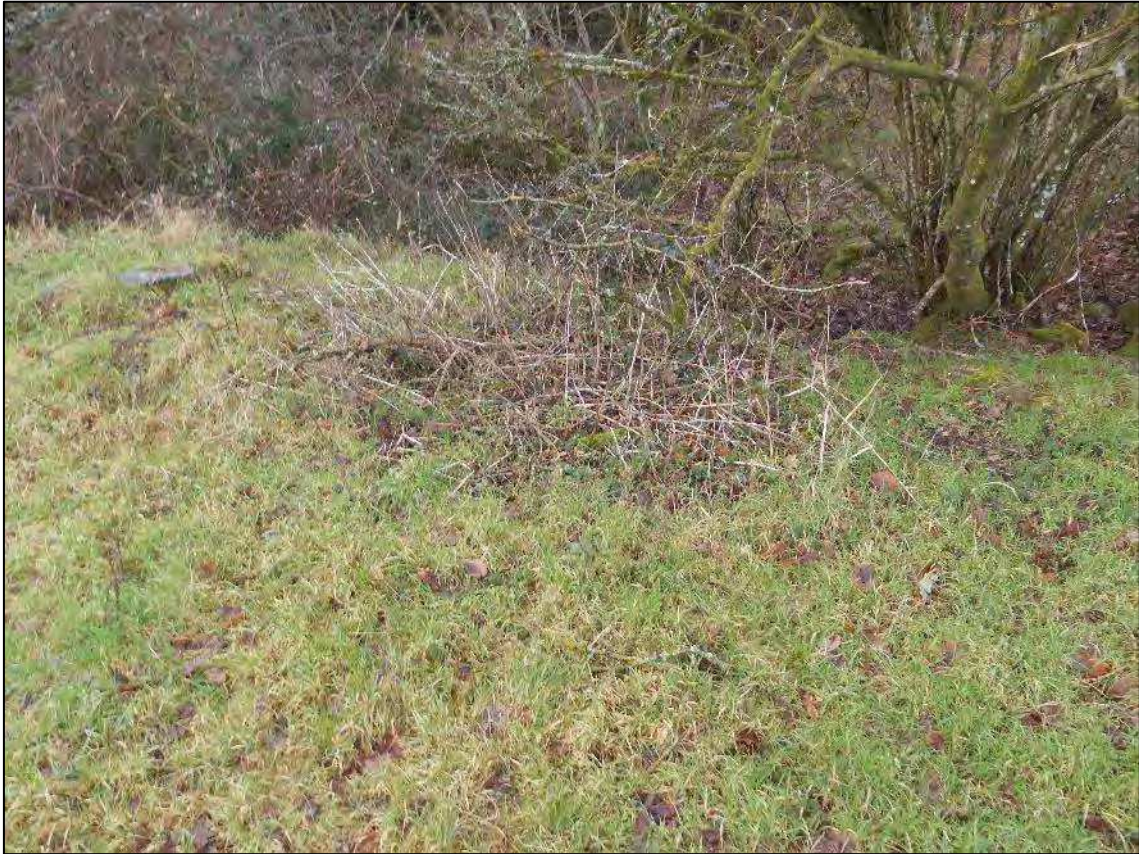
Plate 42. Area 2: location of small pond (GGAT03872s) and possible well, facing south