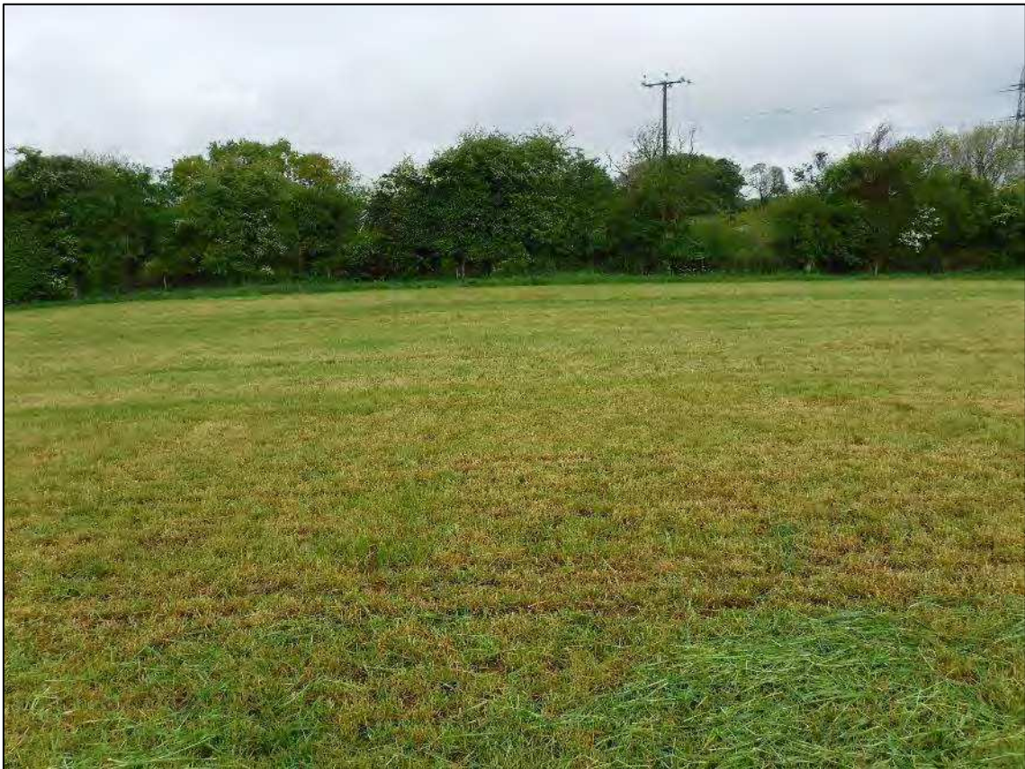
Plate 12. Area 1: location of Post-Medieval structure OFV01, facing north-west