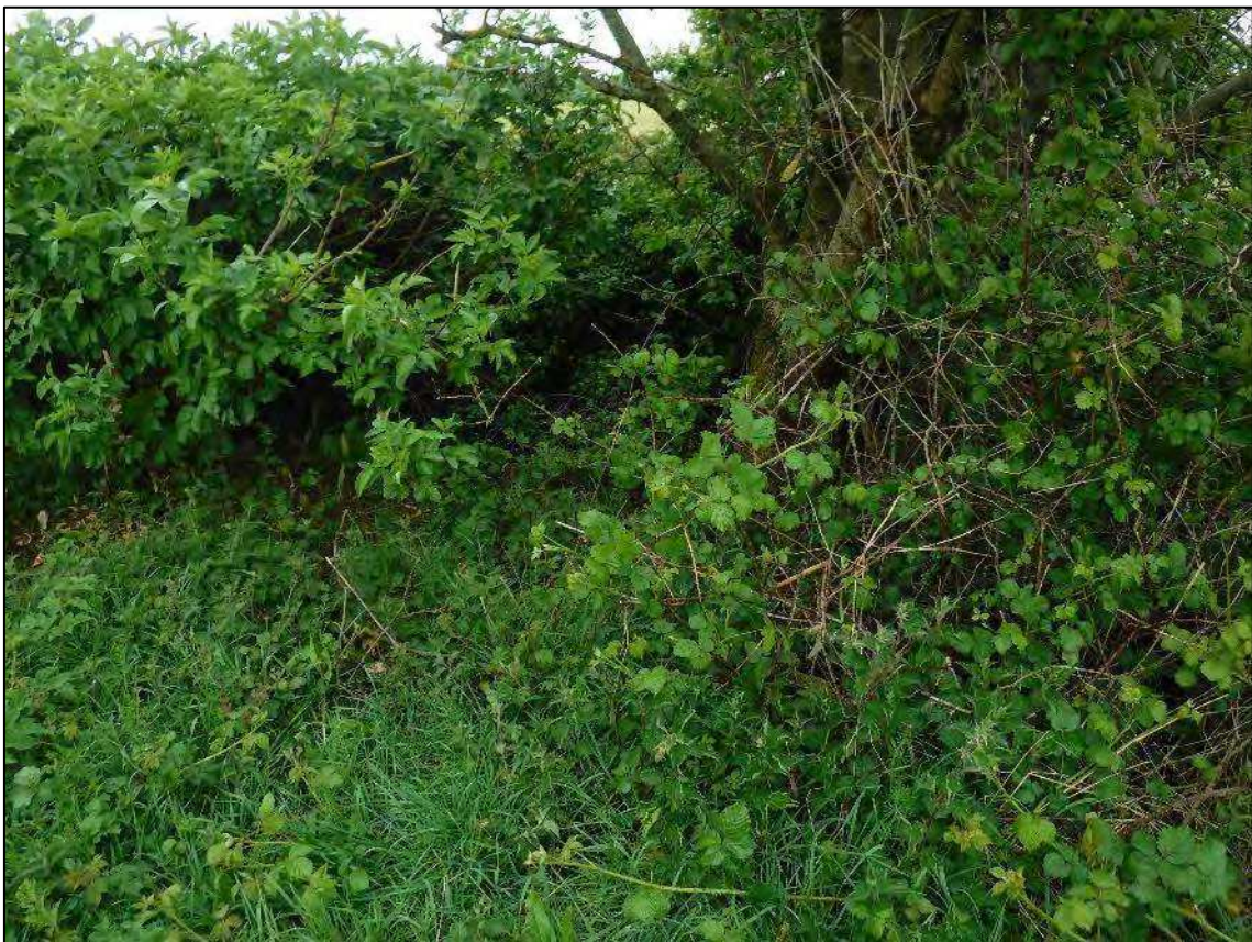
Plate 14. Area 1: location of post-medieval quarry/limekiln OFV02, facing north