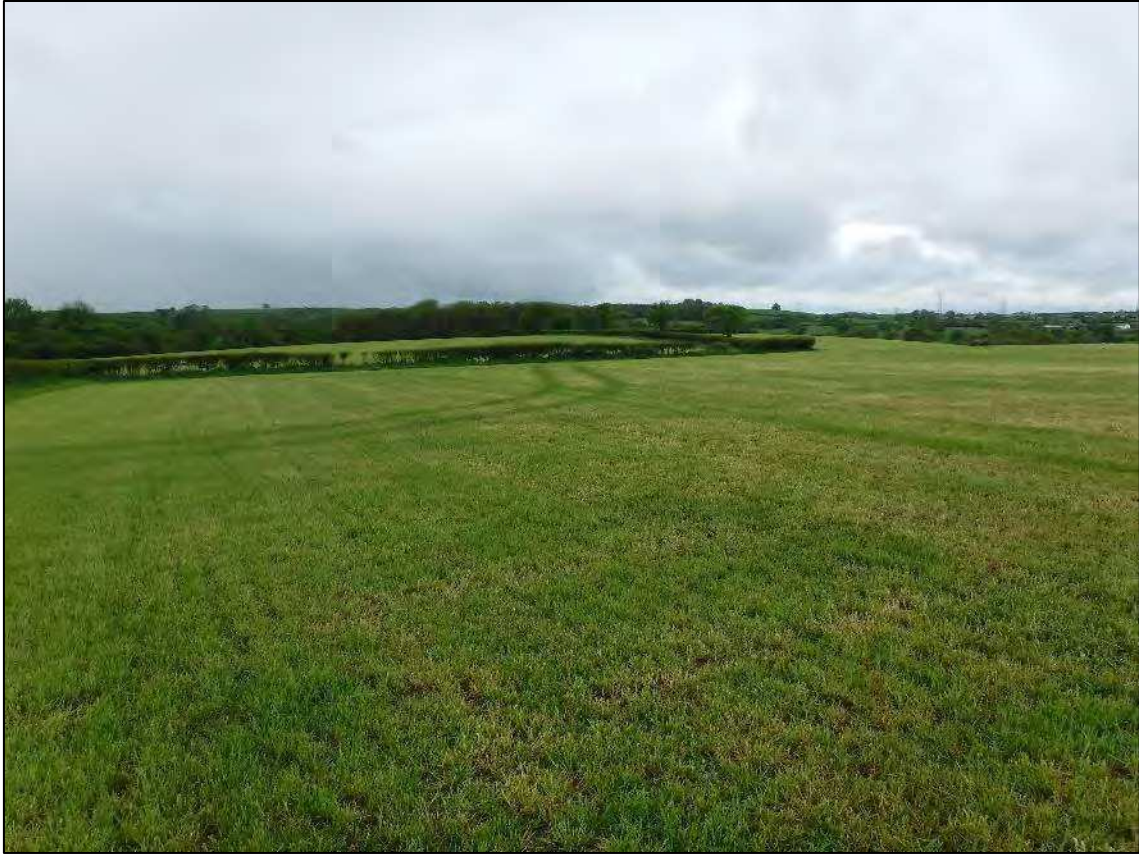
Plate 11. Area 1, facing north-west