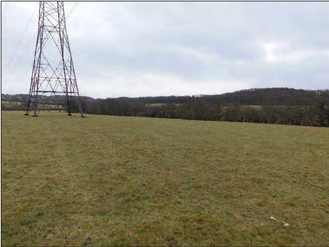
Plate 38. Area 2: location of recorded parch marks (NPRN 422326), looking north-west