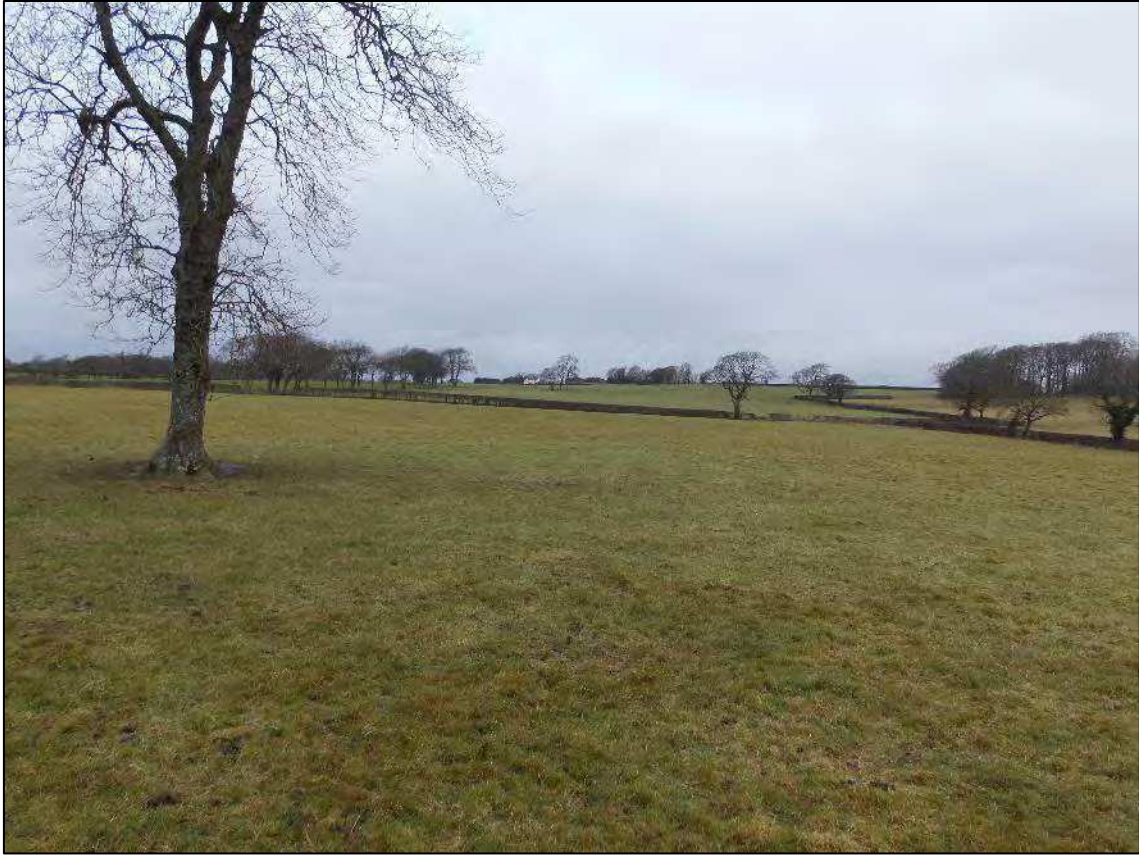
Plate 39. Area 2: location of recorded parch marks (NPRN 422326), looking north