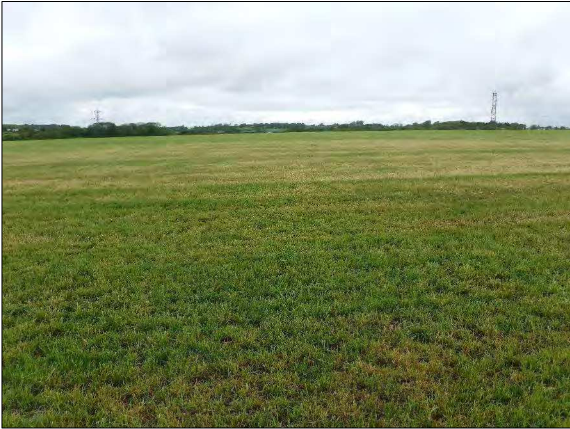
Plate 15. Area 1: location of cropmarks NPRN 309284; GGAT03998s & NPRN 309275, facing north