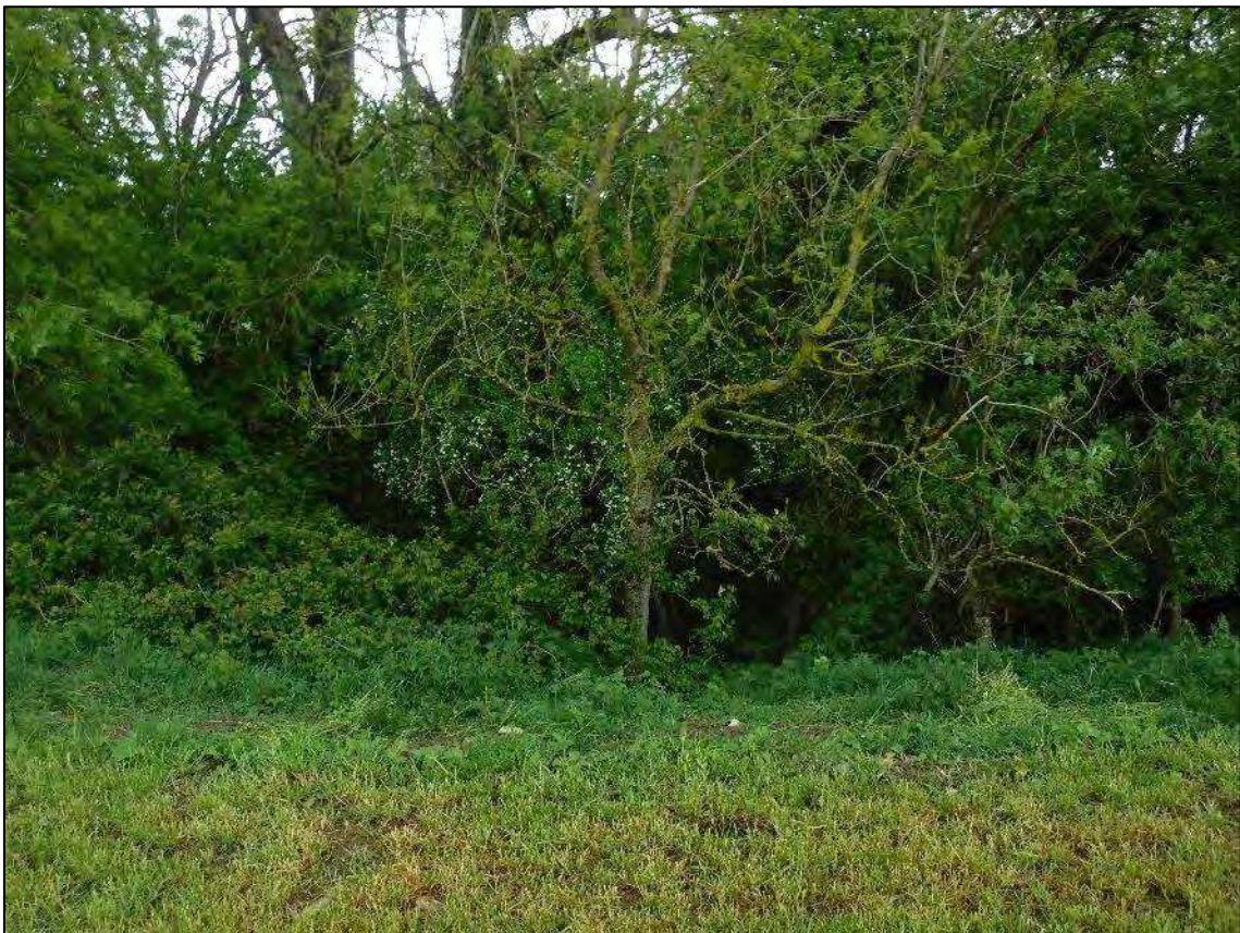
Plate 18. Area 1: location of post-medieval quarry OFV03, facing north