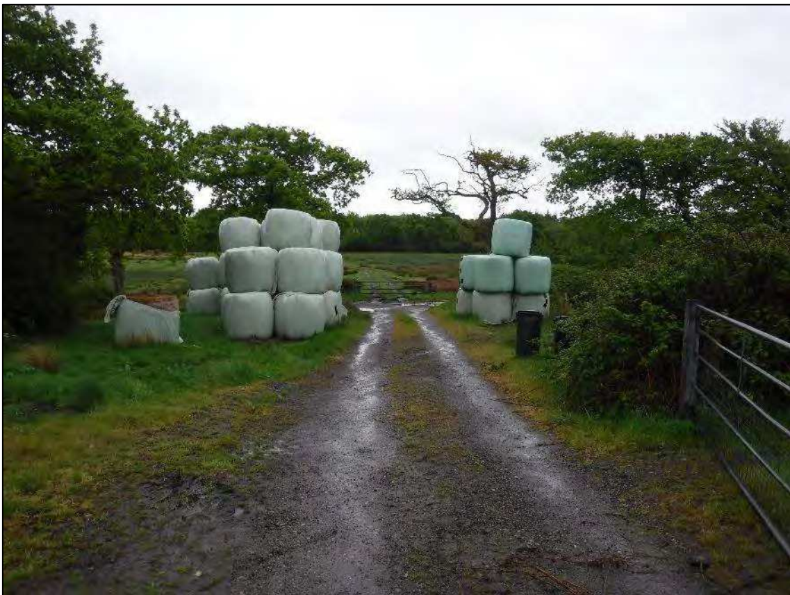
Plate 4. Southern area of Area 3, trackway leading south