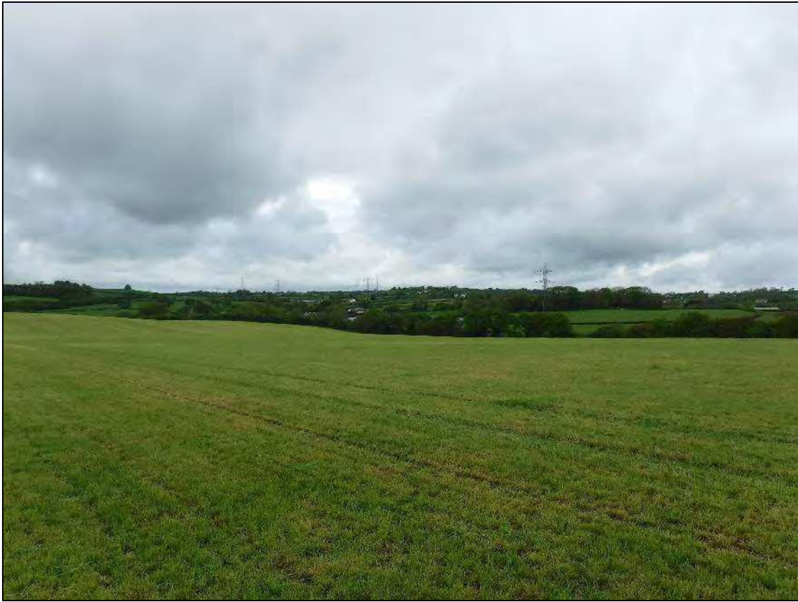
Plate 21. Area 1: Scheduled Monument GM298, on hilltop in far distance, facing north-west