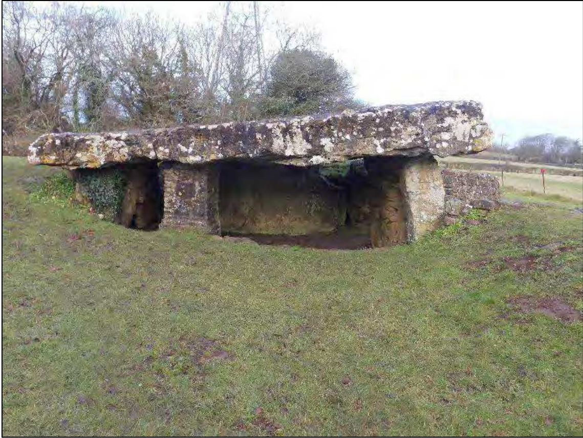
Plate 43. Scheduled Monument - Tinkinswood Burial Chamber (GM009), facing north