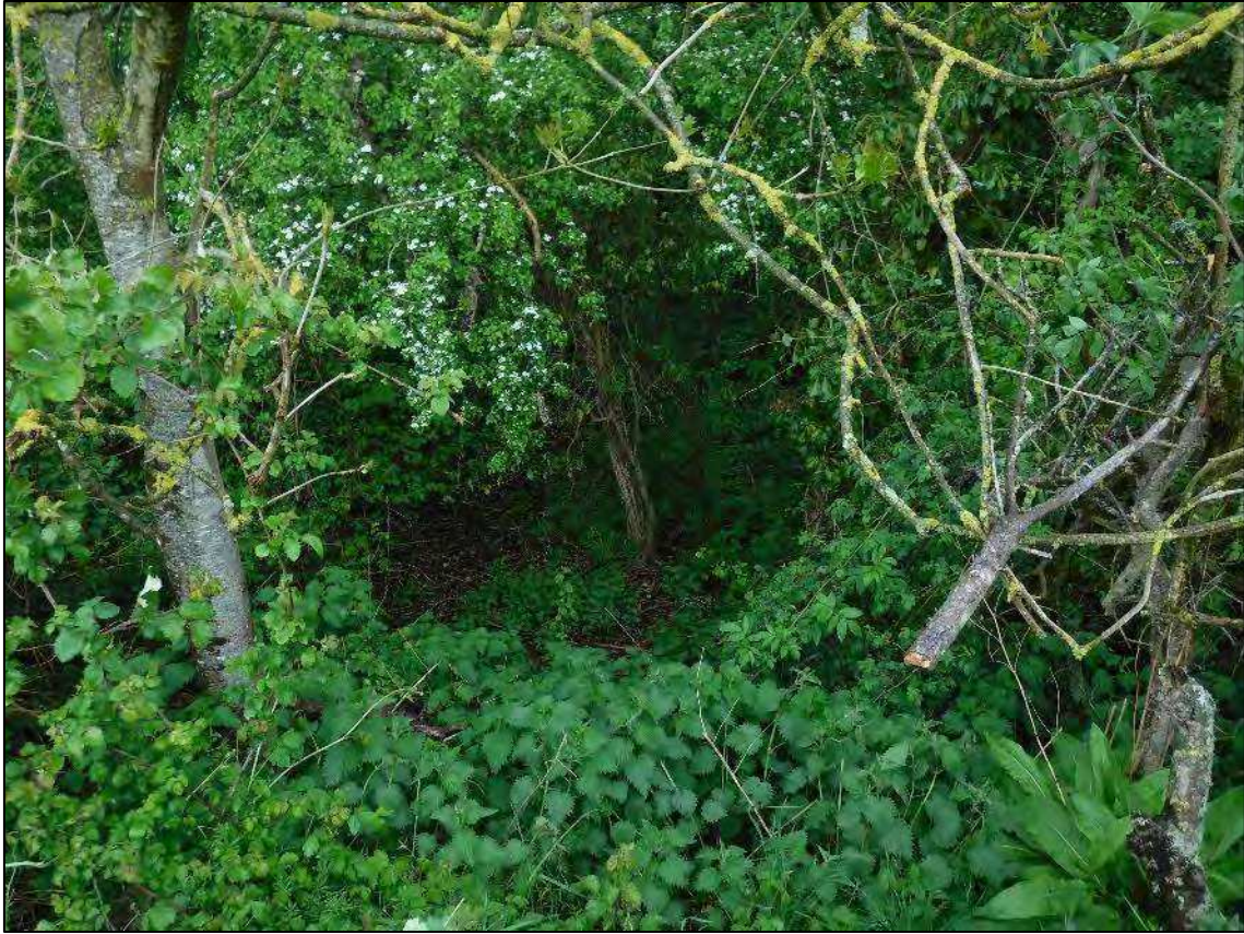
Plate 17. Area 1: location of post-medieval quarry OFV03, facing north