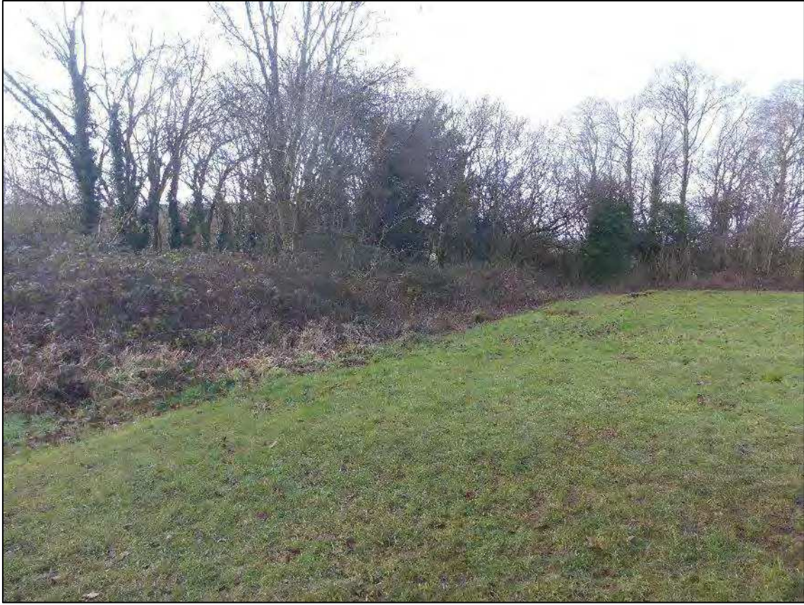
Plate 45. View from Tinkinswood Burial Chamber (GM009) towards site, facing east