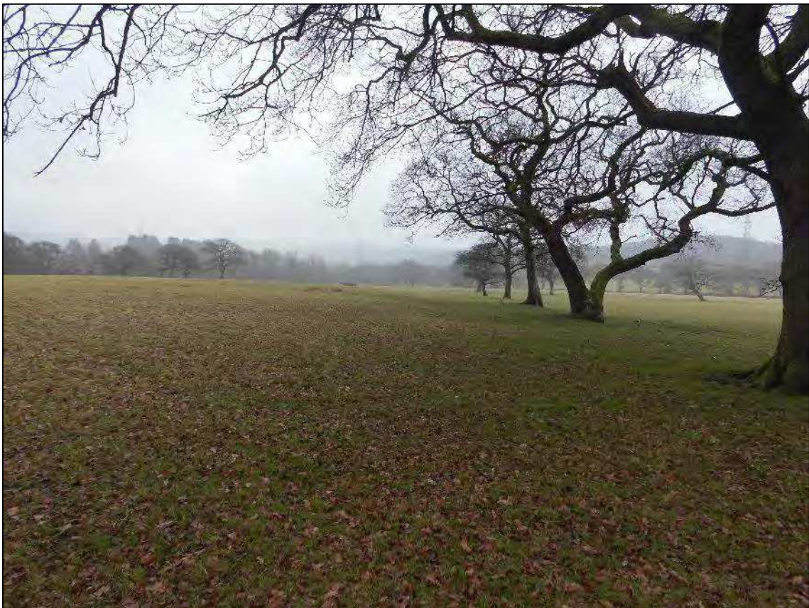
Plate 26. Area 2: GGAT03873s shown by remaining treeline, facing south-east