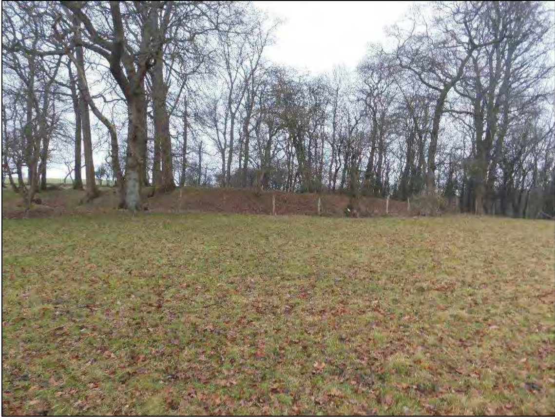
Plate 25. Area 2: GM117 from within the proposed site, facing north