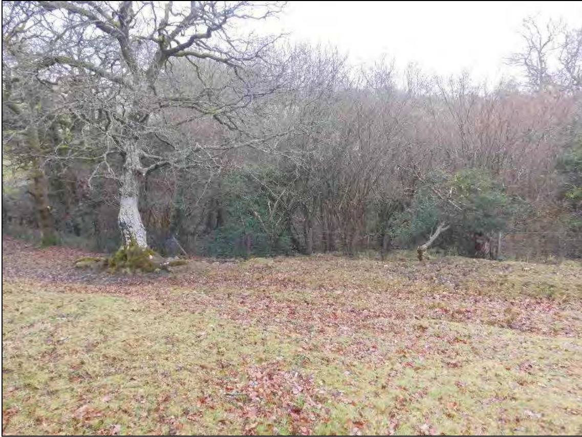
Plate 29. Area 2: looking towards hollow way (GGAT03884s), facing north-east