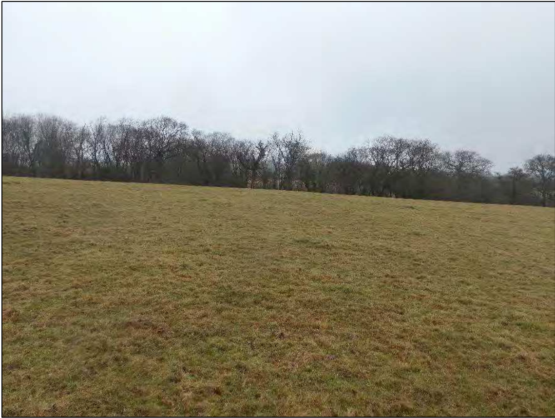
Plate 27. Area 2: approximate area of GGAT03877s, facing north-east