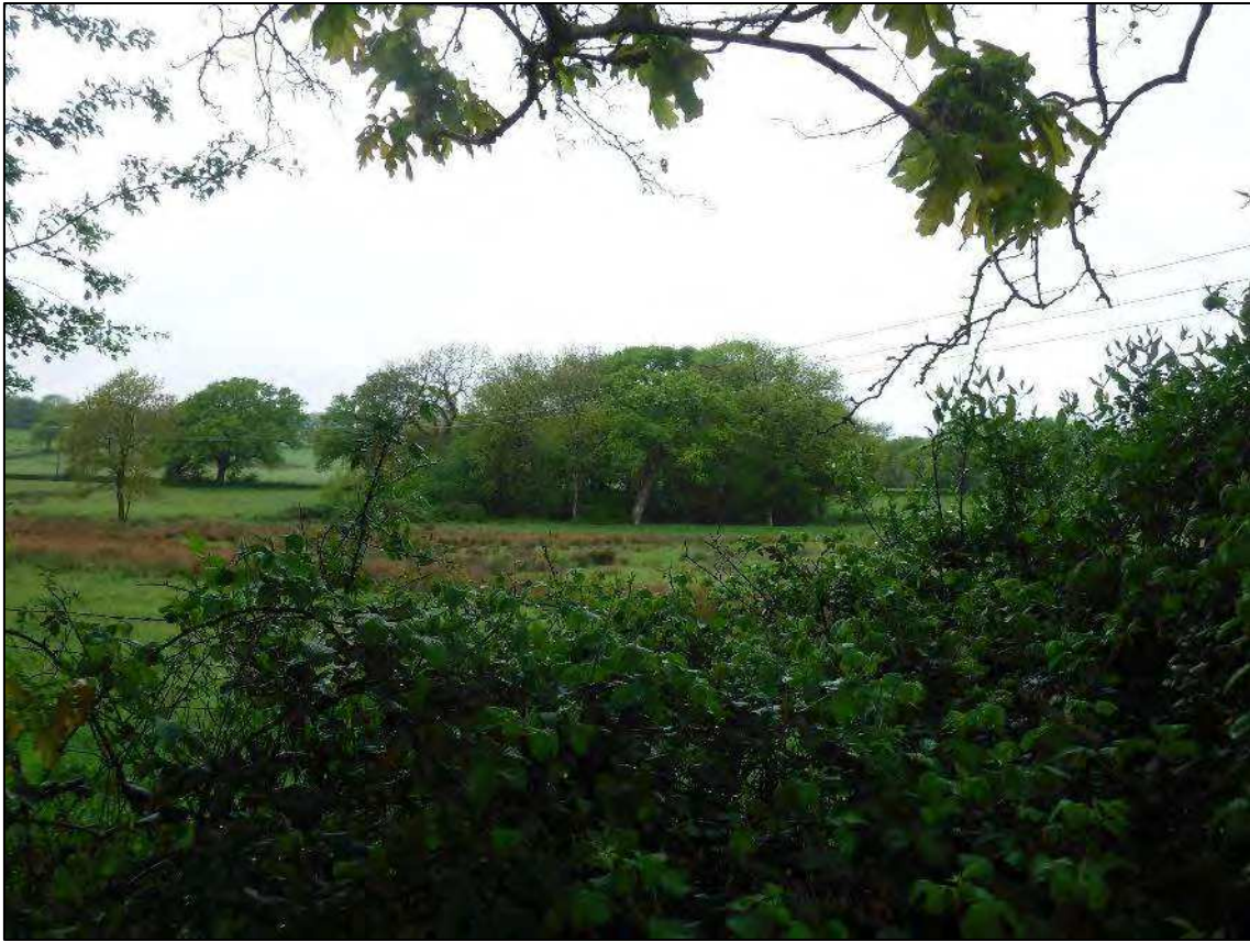
Plate 19. Area 1: Scheduled Monument GM613, facing north-west