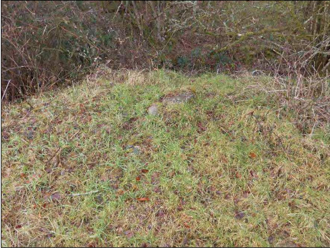
Plate 41. Area 2: location of small pond (GGAT03872s) and possible well, facing south-west